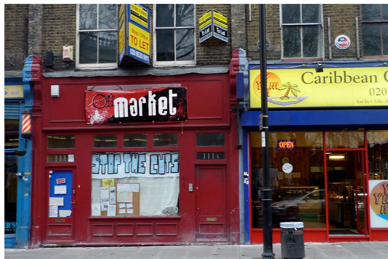
Figure 2. Front of first OffMarket shop, February 2011.

My first visit to the OffMarket, prompted by the email of the opening quote, challenged my expectations. Despite its location on a local high street and an A-board sign with the words ‘we are open COME IN!’ I missed it as the red shop front visually harmonised with surrounding independent barbershops, charity shops and cafeterias (diary entry, 31 st January 2011) [Fig. 2]. My impression of the space’s ‘mimetic’ appearance was shared by other visitors (conversation, 14 th February 2011), including a local long-term resident mentioned how he had seen the shop and decided to walk with his six-year-old daughter, something that he admitted wouldn’t have happened had it looked like a ‘usual squat’ (conversation, 15 th March 2011). In this sense, the OffMarket could be associated to a number of ‘approachable’ community-oriented political spaces, occupied in East and North London between 2009 and 2011, in contrast to “the grimy punk attitude that pervades some other activist spaces” (Maxigas, 2009). The approachable aesthetic was not accidental and derived partly from the desire to open the space to passers-by and local residents, and partly to align it more to the tradition of radical infoshops (Dodge, 1998) rather than to ‘party’ or ‘crash’ spaces, an important distinction made by some self-declared social centres (Lou, 2011).