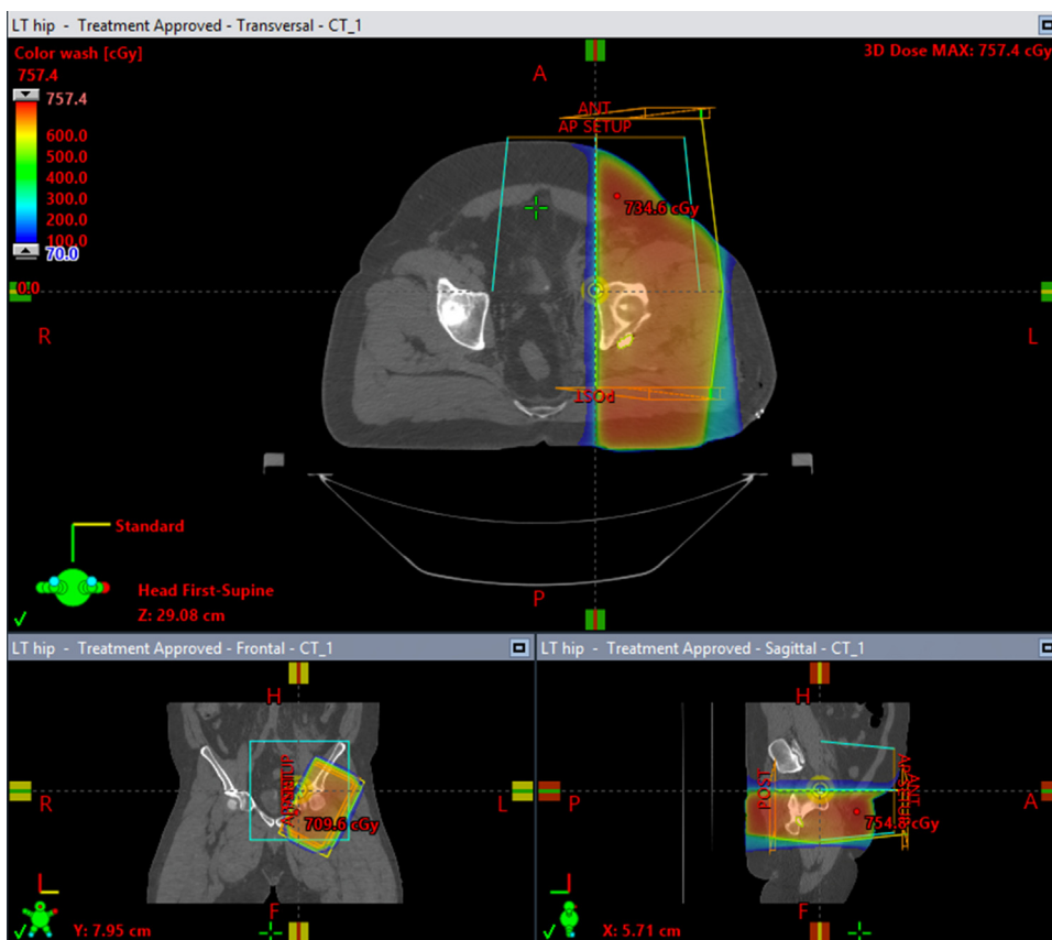
Figure 1 Sample radiation treatment plan. An example of a radiation treatment plan for a patient who received prophylactic radiation therapy after open reduction and internal fixation of the acetabulum following motor vehicle accident.

All patients underwent CT simulation in supine position with legs slightly frog-legged before radiation therapy. Virtually all patients received 7 Gy prescribed to midplane in a single fraction, with the exception of one patient who received 8 Gy. Treatments were delivered with opposing AP and PA 6 MV or 18 MV photon beams. An example of a typical treatment plan is shown in Figure 1.