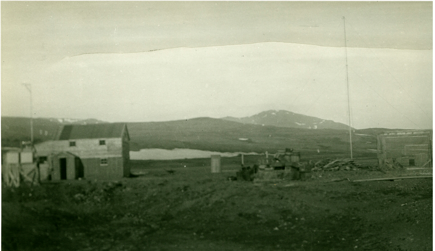
The wireless stations at Myggbukta (East Greenland).

expedition would be granted police authority over all persons in east Greenland. 35 By December of 1930, the situation heated further as news of the upcoming three-year Danish expedition by Lauge Koch had spread, with some in Norway viewing it as a covert means to subvert future Norwegian claims. The Norwegian government again rejected calls to formally occupy part of east Greenland, but on 27 June 1931 a group of Norwegians on the island raised the flag above Myggbukta Station and claimed the