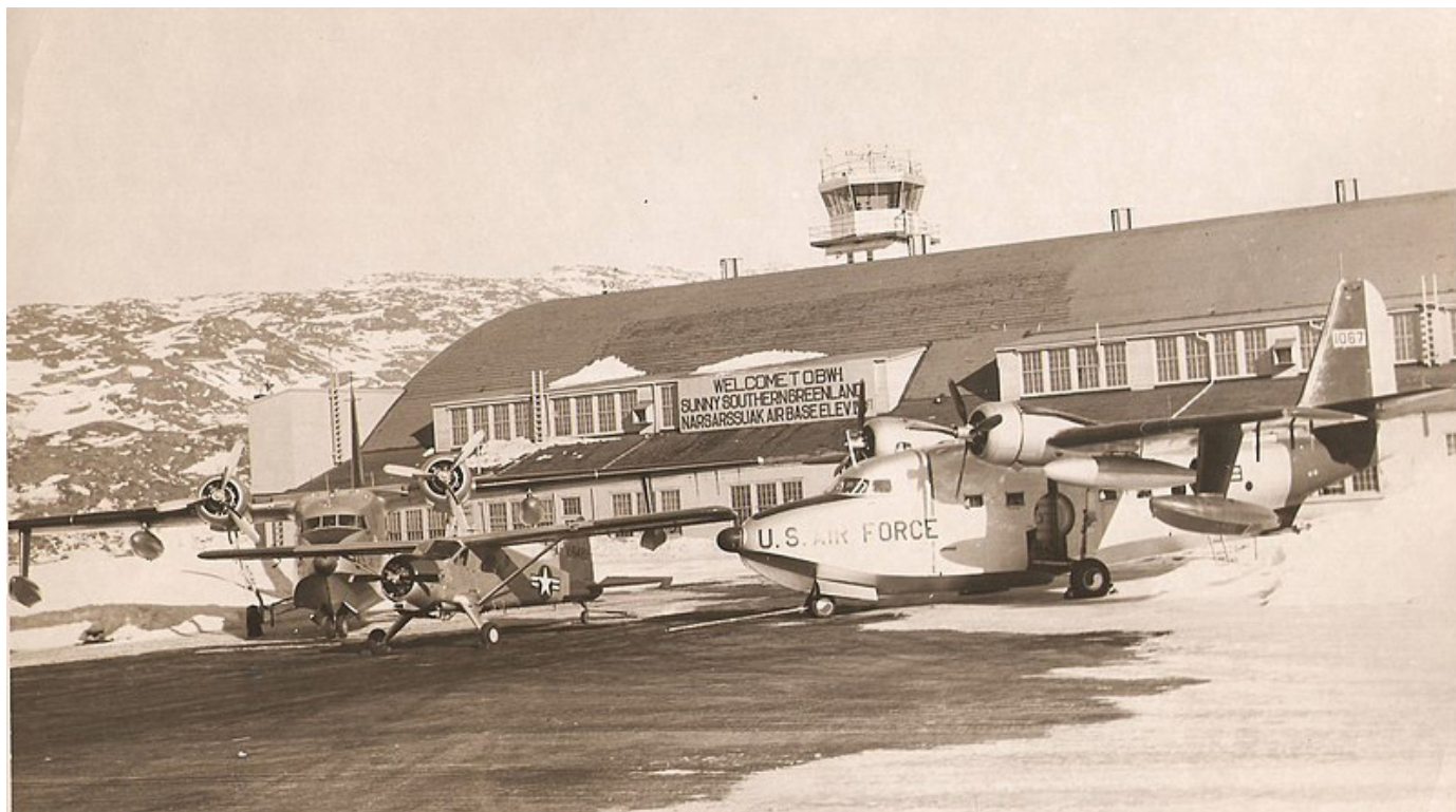
The US Narsarssuak airbase on Greenland in the mid-1950s. The base was originally established during World War II (1941) with the code-name Blue West One. Adjacent to the airbase was since 1943 a military hospital with 250 beds.

at the end of the war had demonstrated when he decided to give up the de-facto sovereignty and to return the political power back to Copenhagen. 49 On the other hand, the domestic discussion in Greenland in the immediate post-war period was characterized by the question of simply returning to the old administrative structures of the pre-war period or to modify the administrative structures within the Danish context and to provide better representation of the Greenlandic