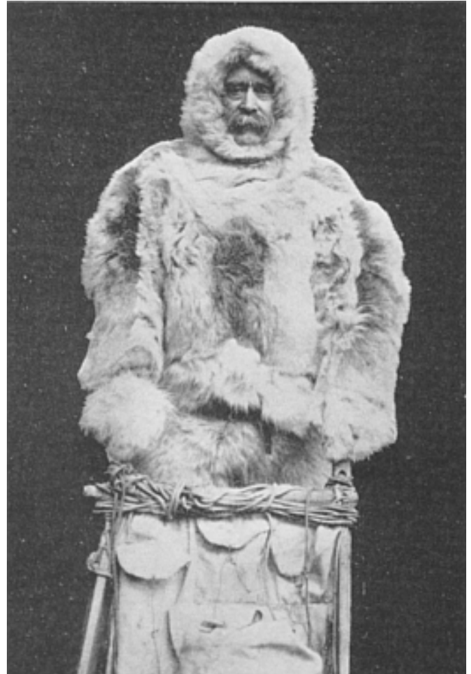
GS02: Robert E. Peary

Henson begins Chapter X, "Forward March," of his 1912 publication with a photo, "Robert E. Peary in his North Pole Furs" (27). On a black background, Peary stares at the camera with an unsmiling, grave face, his signature