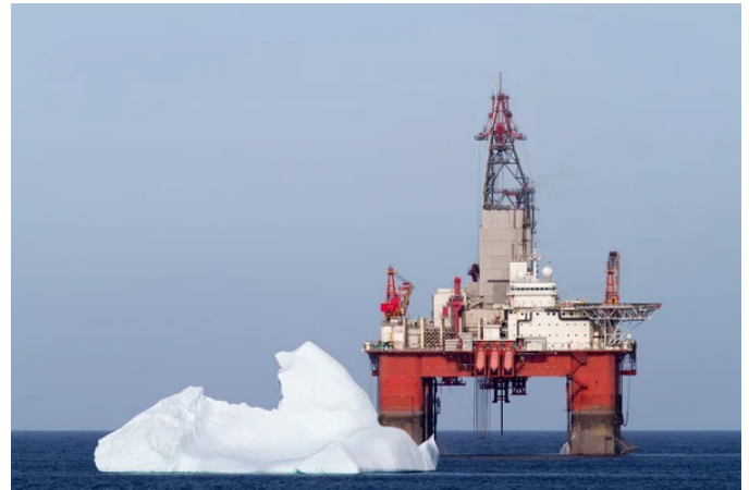
Arctic drilling platforms are technologically sophisticated infrastructure which extract hydrocarbons from far below the seabed and drive the High North's economy.

These resources are the lifeblood of China's economy and even a limited disruption in their supply ripples throughout their economy with consequences valued in billions of yuan. Securing a diverse portfolio of suppliers for these vital resources is paramount for China to avert economic disaster and assure continued, predictable growth. Within Chinese domestic discourse, resources in the evolving Arctic present an opportunity to both pursue new extraction ventures as well as promote "energy cooperation and achieve joint economic development" with other Arctic actors. 22