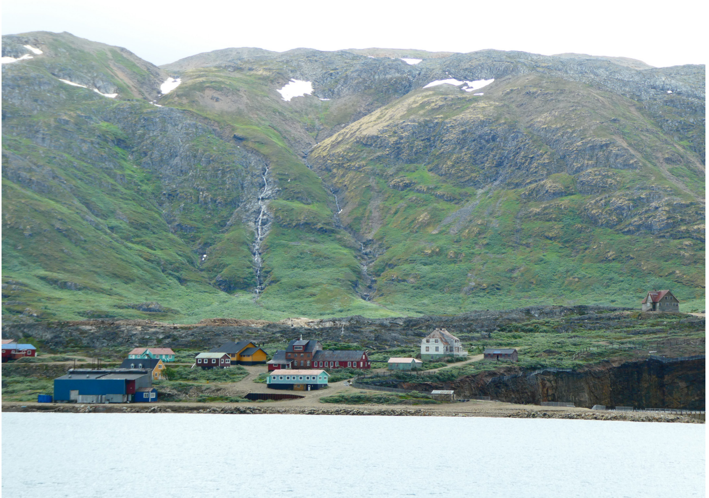
The abandoned cryolite mine in Ivigtut in July 2022. Besides using Greenland as a stepping stone for ferry-flights between the US and Europe, the cryolite mine in Ivigtut was one of the main reasons for US military engagement in Greenland during World War II.