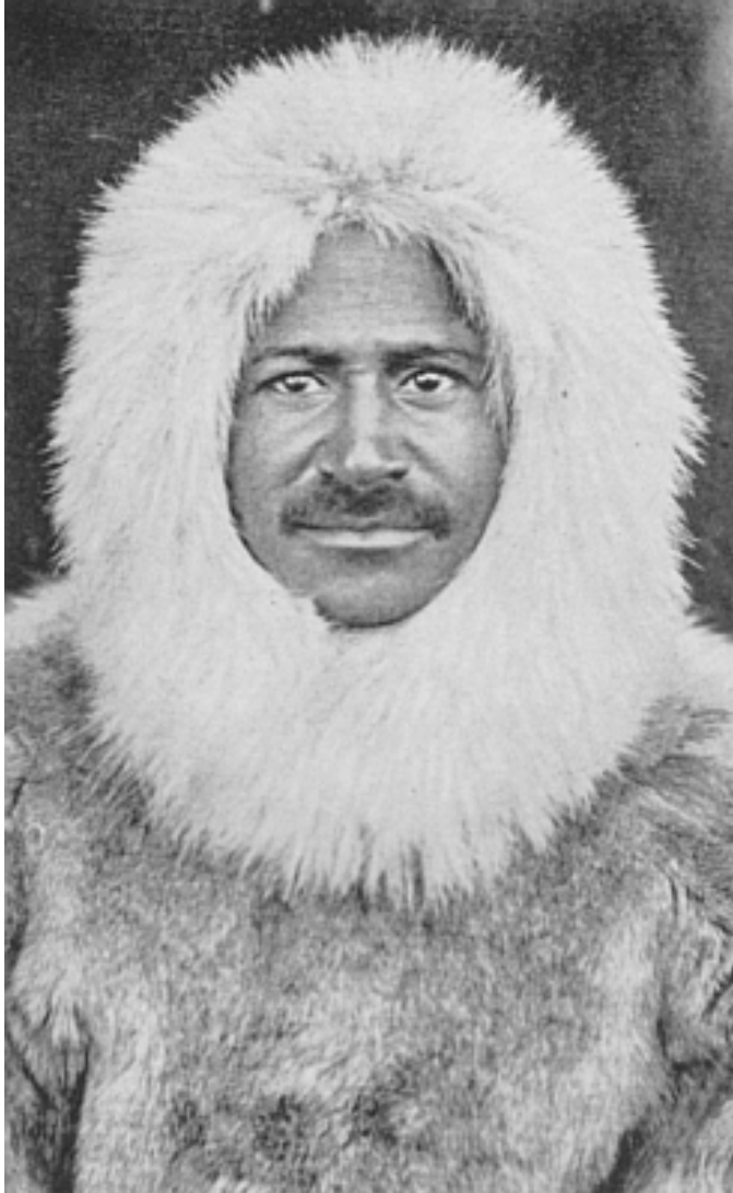
GS05: Matthew Henson upon his return from the North Pole expedition.

Canal. His first visit to the Arctic took place in 1886, before he met Henson, when he failed to cross Greenland by dog sledge. In the 1891-92 expedition, he reached Independence Fjord and proved Greenland to be an island. His 1898-1902 expedition set a record by reaching the farthest northern point of Greenland, which he named Cape Morris Jessup after his most affluent financial benefactor. He tried unsuccessfully to reach the North Pole with