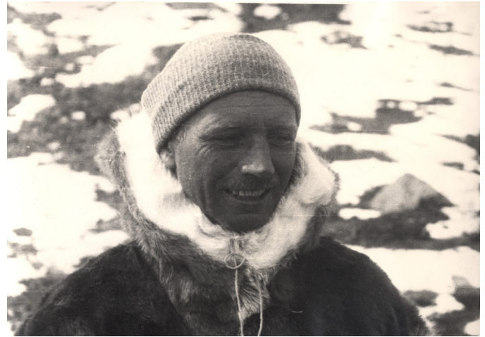
Greenland Photo: Rockwell Kent #624 Rights courtesy of Plattsburgh State Art Museum, State University of New York, USA, Rockwell Kent Collection, Bequest of Sally Kent Gorton. All rights reserved.

as a “territorializing machine,” it transformed soils into discrete territories by means of violence, law, and cartography. 1 One of the most potent instruments through which this transformative process occurred was the outfit and the deployment of expeditions in order to lay hands on lands supposedly primordial and unclaimed. 2 Through the practice of “discovery,” which included gathering geographic knowledge of a particular region, identifying and exploiting resources, founding settlements and trading posts, crafting laws and regulations, and generally excluding Indigenous voices—which explorers, soldiers, missionaries, settlers, prospectors, and traders relied upon—from their records, expeditions served as a vehicle of the colonial state through which claims to territory could be formalized. Crucially, though, expeditions also served as a means to support the legitimacy of these colonial “possessions” at home and abroad, a role that would become increasingly significant throughout the 19th and early 20th centuries. Through books, lectures, articles, drawings, and later in photographs and films, expeditions transmitted knowledge of regions far away, including their economic potential, to domestic and international audiences. This