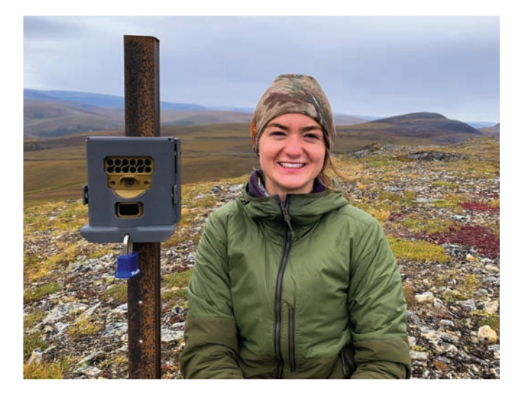
FIG. 1. The author with a remote wildlife camera in the Northern Richardson Mountains, August 2021. Cameras are mounted in a bear-proof lock box to a steel pole that has been hammered deeply into the ground.