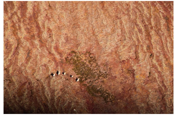
FIG. 3. A group of divii in the Northern Richardson Mountains photographed during the 2021 aerial survey, September 2021.

Annual minimum count aerial surveys were conducted in 2019, 2020, and 2021 to provide standard population demographics to validate the remote camera data (Fig. 3).