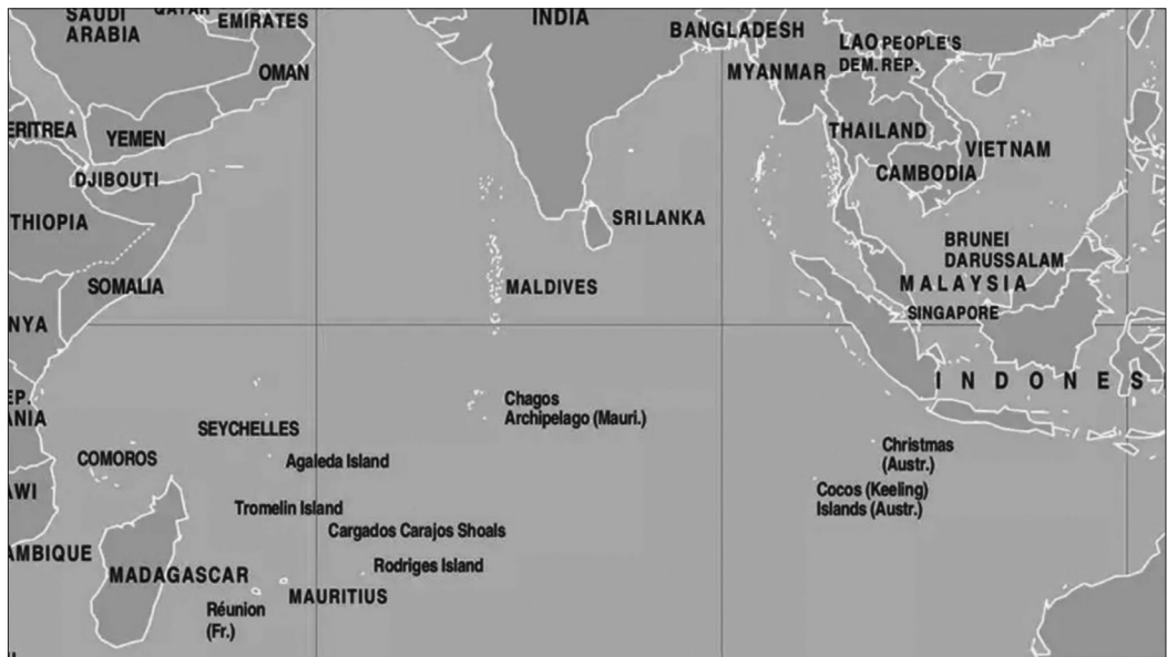
Map 1. Map of the Indian Ocean