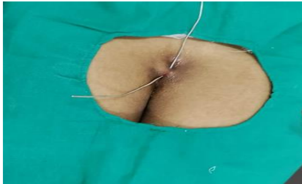
Fig 3: Ksharasutra-in-situ