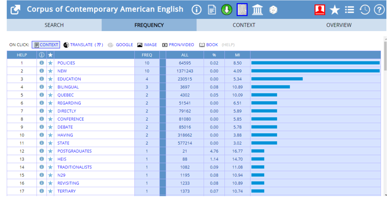
Figure 4. The immediate environment consists of the following lexical units: POLICIES, NEW, EDUCATION, BILINGUAL

The frequency of use of the lexical unit language policy in the Corpus of Contemporary American English is 53 mentions. A total of 130 collocations are displayed. The lexical units policies and new are most often mentioned, three mentions belong to the lexical unit education, 2 – bilingual, regarding, directly, conference, having, state (Figure 4).