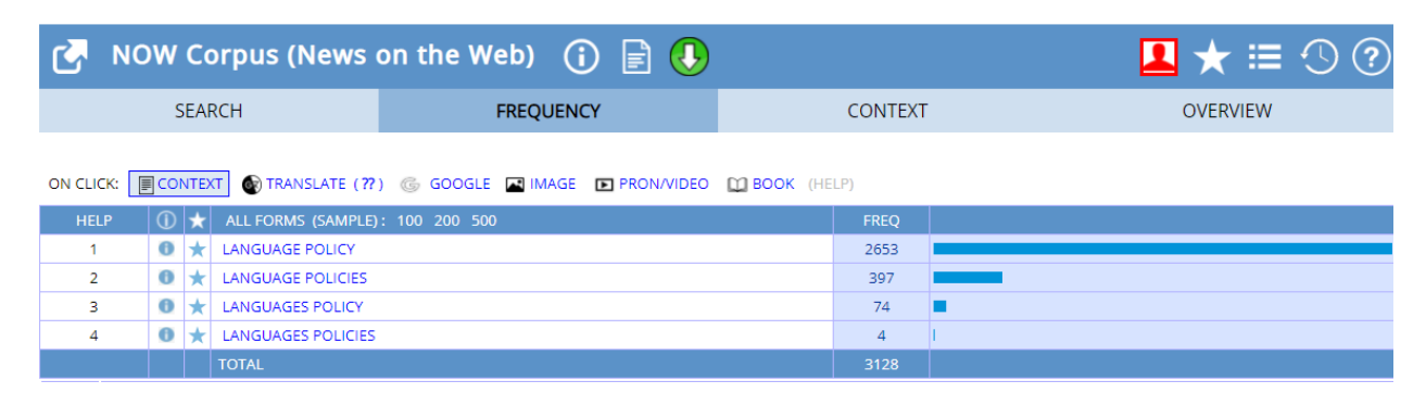
Figure 5. A study of the colloquialisms of the lexical unit language policy in the NOW Corpus

A study of the colloquialisms of the lexical unit language policy in the NOW Corpus (News on the Web) has the following results. In the following picture we see the following results (Figure 5).