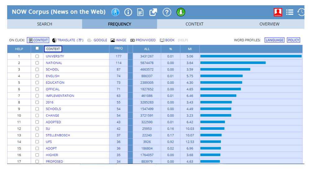
Figure 2. Collocations based on the NOW Corpus

The largest volume is the News on the Web (NOW corpus) – 2653 mentions. The top ten most used collocations include: university, national, school, english, education, official, implementation, 2016, schools, change. The frequency of use of such lexical units as bilingual, multilingual is 9 mentions, trilingual and multilingualism – 7 and 4 respectively (Figure 2).