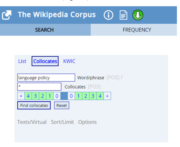
Figure 1. The first step to analyze the verbalizers of the concept language policy based on the corpora

The following is a detailed analysis of the concept research process based on the corpora of texts. The first to be considered is the study of collocates-conceptualizers on the basis of already existing data corpora of the site english-corpora.org (English Corpora, 2020). The principle of frequency of use was defined as follows: on the site english-corpora.org in the search section the function collocates was selected (Figure 1).