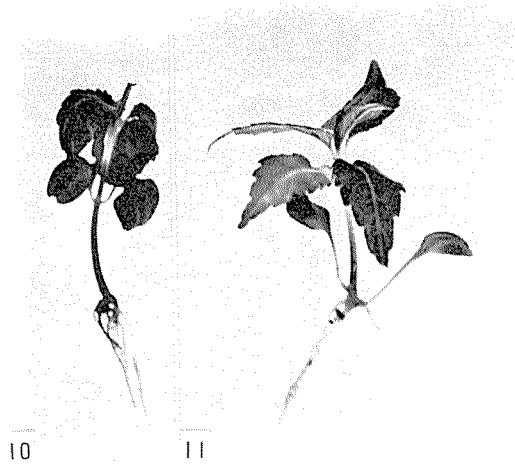
Figs. 10~11 Seedlings of I. racemosa ( \times 0.7 ) 10 : Showing a normal form, 11 : Showing an abnormal form without elongated hypocotyl.