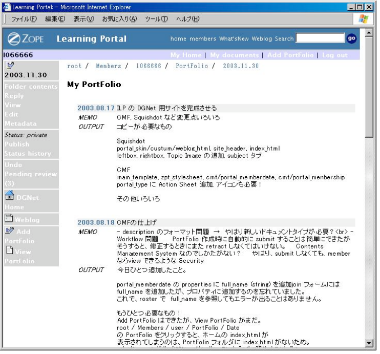
Figure 2: Personal portfolio window

In order to evaluate students' records, teachers can see multiple pages in one view, look for pages using various keys, and mark them.