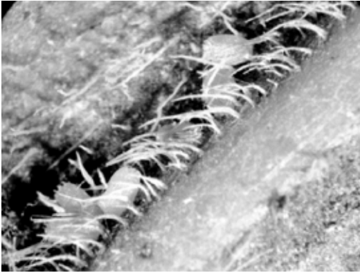
Fig. 1. Photograph of the eggs of the predatory mite A. ignipicta laid on a S. senanensis leaf (among the spiny trichomes) in the center of a colony of the eusocial aphid C. japonica .