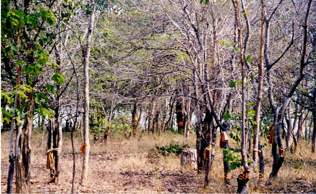
Photo 1: Trees are bonded by yellow cloths by Buddhists Monks marking that these are Monks trees.