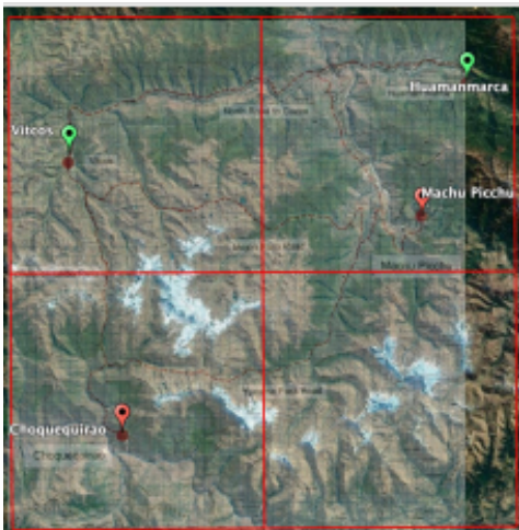
Fig. 2. Google Earth map of the study area divided into four sectors using the Overlay Tool (Lee 2010).