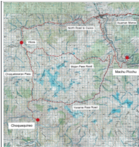
Fig. 1. Google Earth map of the study area.

Wilkinson, Darryl, 2019, Infrastructure and inequality: An archaeology of the Inka road through the Amaybamba cloud forests. Journal of Social Archaeology , 19(1), 27–46. https://doi.org/10.1177/1469605318822551