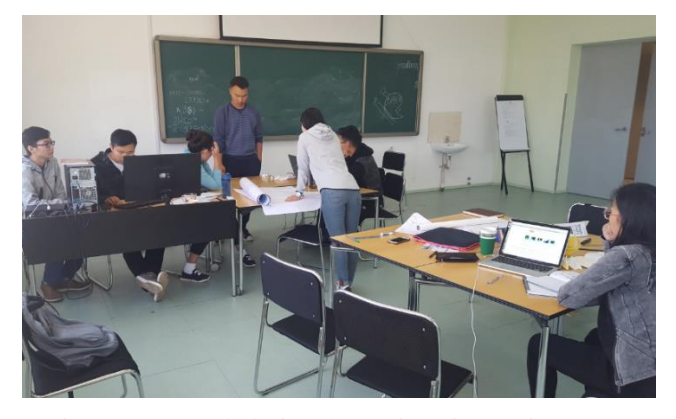
Fig. 1. Teamwork during the engineering project course

The important factors of a successful project are interdisciplinary project tasks, sophisticated logistics, a project team including professors, team assistants, and expert advisors, and an operational plan including surveys. To improve the practice, a project team conducts surveys.