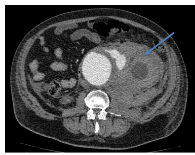
Fig. 2 Axial view of a ruptured AAA