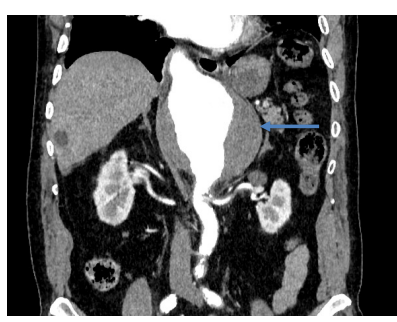
Fig. 1 Coronal view of an AAA