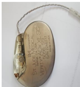
Figure 2. Detaching from pulse generator, the Lead damage due to rust inside the socket of device

We think that extraction or box change is an art which should be done in a scientific and rational way. Box change has no alternative but the procedure should be done in way to be made minimally invasive. However the lead integrity must be checked before and during the procedure and all care should be exercised to avoid any damage to the lead during the recovery of box. Though the incision for box change is slightly different from the explanation of the entire assembly and device, one should be prepared for the unexpected, as lead is sometimes intact from every expect on programmer before opening the area but becomes damaged during device recovery and must be replaced. It happened to us in one case the lead was well functioning but the pulse generator was exhausted. We recovered the device and unplugged the lead but due to rust, which is not a documented complication in devices, the lead could not be separated and just a bit more traction badly damaged the lead figure: 2.