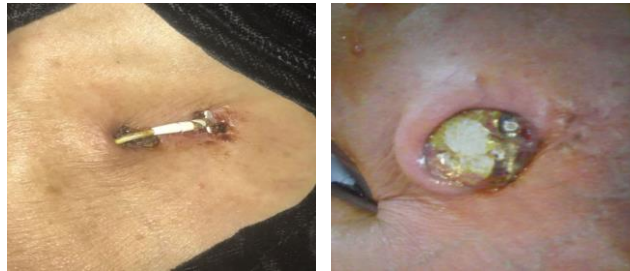
Figure 1(a). Lead and device erosion.

suit on hand. Once the lead is out, we check the heart for any effusion on echocardiography.