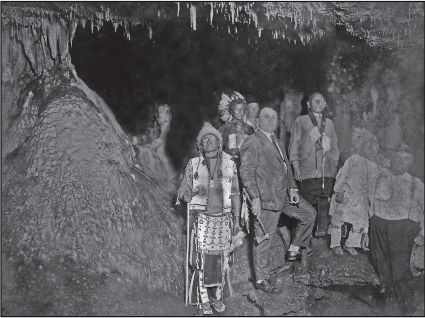
Kiowa cast members at Percy Cave, Missouri (photograph courtesy of Jana Freeman).

in Joplin. The Springfield theater was a combination theater, showing both film and vaudeville acts to a crowd of up to 1,100 individuals. 73 There was no orchestra pit, so the eight-piece orchestra played on the auditorium floor in front of the stage. 74 After the theatrical showing, there was also a stop by Hunting Horse and Esther LeBarre at Percy Cave, now known as Fantastic Caverns. 75 At that time, the cave was owned by J. W. Crow and was used as a tourist spot, but because of its waning popularity Crow also used it as a speakeasy by night and sought alternative ways to promote its use. The fanfare brought by the Kiowas and their show was surely a welcome event.