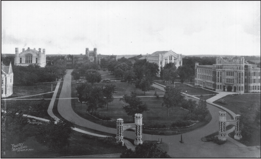
The North Oval, now known as Parrington Oval, at the University of Oklahoma in Norman.

However, once the naval training base closed after the Second World War, housing on the base for African Americans ended as well. 63