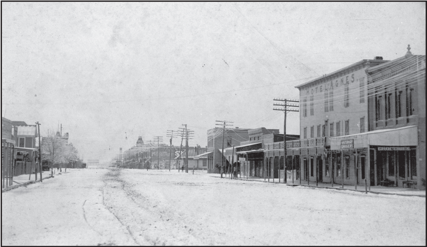
View of the 100 Block of West Main Street in Norman looking east, c. 1900.

gation that was decided by the Oklahoma Territorial Supreme Court in 1900, the lawsuit stated that for the past three years conspirators in the town of Norman had “openly and notoriously threatened, assaulted, and beaten from said town law-abiding colored citizens of the United States.” 17 The lawsuit also stated that “at no time since the inception of said conspiracy, as foresaid, has any colored person ever labored, lived, or lodged in said town or been permitted to do so.” 18 No one was ever brought to justice or convicted of any crime in relation to this violent mob attack. 19