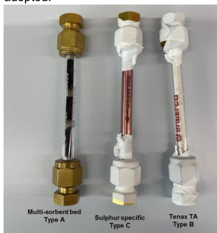
Figure 1: Sorbent tubes used in this study

Tubes A (Multi-sorbent bed), developed and described in (Ribes et al., 2007), are designed for the determination of both polar and non-polar VOCs, to be adopted in different scenarios and obtain the collection of different classes of compounds. For A and B types, sorbent materials were inserted manually inside glass tubes, obtained from Supelco (Bellefonte, PA, USA). On the contrary, types C, and inert-coated stainless-steel tubes were adopted.