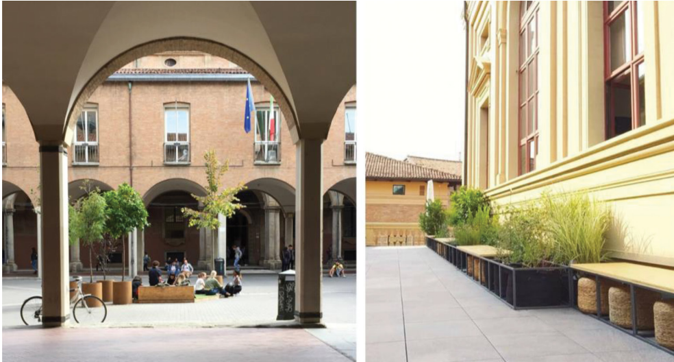
Figure 2: (a) ‘U-Garden’, the project for the pocket garden realized on the terrace of the Municipal Theatre of Bologna in the summer 2019 and (b) the intervention on Piazza Scaravilli implemented by ‘The Five Square’ workshop (Source: ROCK Project, 2019).