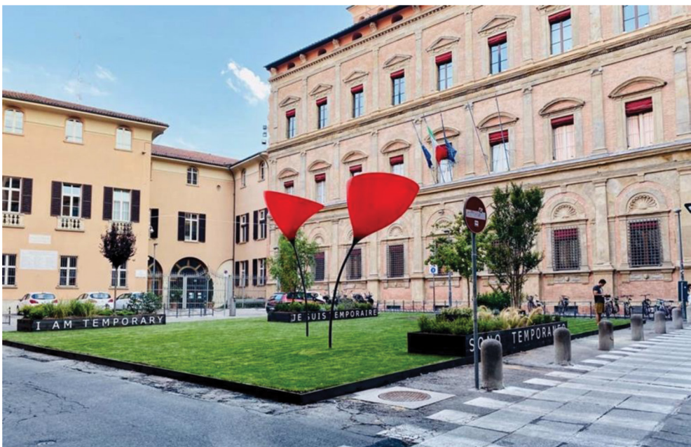
Figure 5: The ‘Green Please 2.0’ installation completed, June 2020.