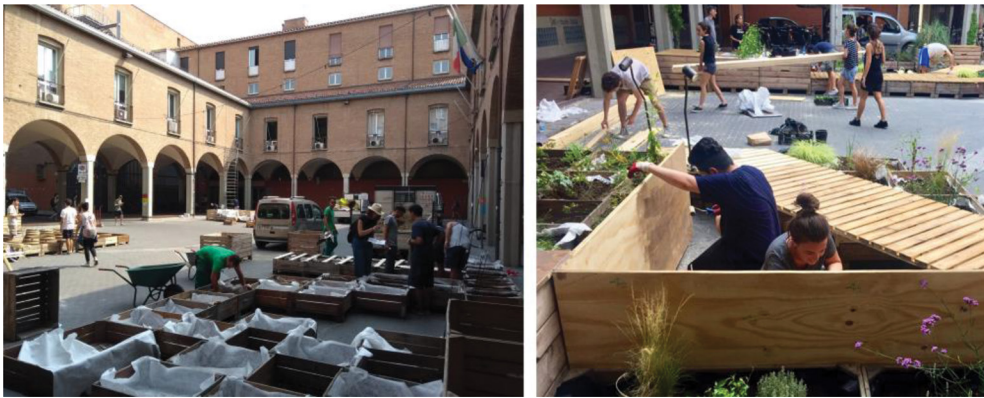
Figure 3: ‘Malerbe’ temporary construction in Piazza Scaravilli, outcome of a co-design and co-construction workshop coordinated by the Department of Architecture, University of Bologna with Centro Antartide that changes the parking area into a dynamic urban garden.

self-construction and co-management were key steps in involving local stakeholders in a daily-care process for these public spaces. Such experiences demonstrate the potential of low-cost, participated and temporary transformations on CH and their capability to positively influence long-term urban dynamics and to re-activate communities as well as places.