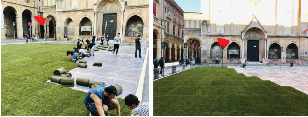
Figure 4: Co-construction phases of the ‘Green Please: the meadow you don’t expect’ temporary reconfiguration of Piazza Rossini, September 2019.

The co-designed temporary greening interventions for Piazza Rossini – in addition to the spatial transformation of the public square and its changing perception – show how a reversible intervention can trigger dynamics of re-activation of communities, as well as places, raising awareness on climate change issues, favouring the biodiversity of the area by the injection of functional green in places of culture.