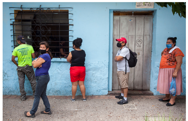
People queue to buy tortillas in a local shop after a lockdown was ordered by Guatemala's President to contain Covid-19.