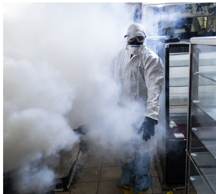
A municipal worker in Dakar, Senegal, uses a fumigant to disinfect the Tilene Market in the Medina neighbourhood, while outside a bulldozer demolishes informal shops to stop the spread of Covid-19.