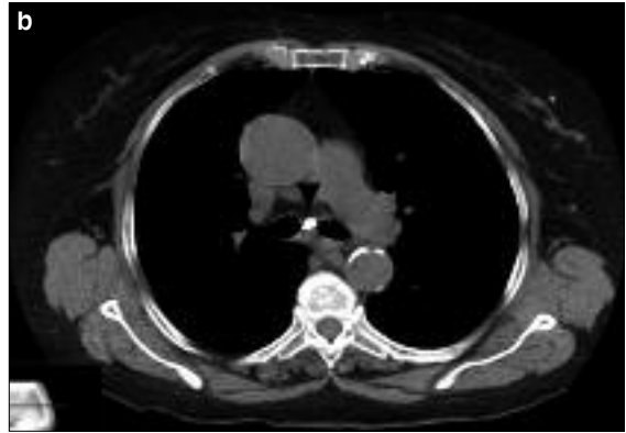
Figure 1 - a) Neck CT show the infiltration of the hypopharynx wall with left pyriform sinus obliteration (black arrows); b) chest CT show subcarinal calcified lymph node (black arrowhead).

physical examination, the patient had an ulcerated swelling on the left border of the base of the tongue, cervical lymphadenopathy and ulnar deviation of metacarpophalangeal joints bilaterally.