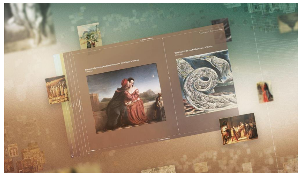
Fig. 1. The gallery of Paolo and Francesca's scene, one of the 413 galleries.

The project was released in June 2021, for the occasion of the 700<sup>th</sup> anniversary of Dante Alighieri's death, besides hundreds of commemorative events that took place in Italy throughout 2021.