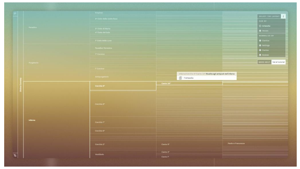
Fig.2. The interactive menu visualization of Divine Comedy 's structure and plot.

artworks). Each column of the interactive menu (Canticas, Settings, Cantos, and Scenes) can be normalized to further analysis.