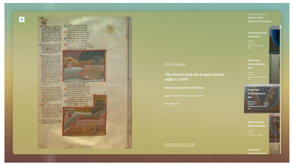
Fig. 3. Artwork page with metadata and related artworks.

Clicking on a scene makes it possible to enter the relative gallery. Users can drag or scroll through the artworks while listening to the related audio verses. Users can browse the detail page for each artwork to analyze its metadata and external links or crossbrowse the website by choosing artworks from the same author.