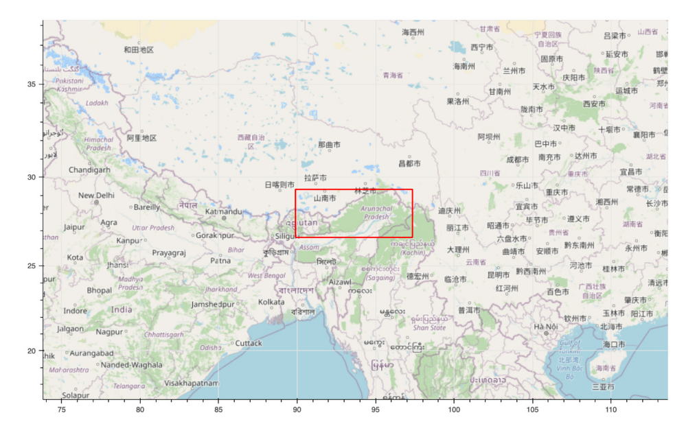
Figure 1. Overview map of the eastern Himalayan region with the area of Figure 2 highlighted (baseline © OpenStreetMap contributors, modified by Mei-Shin Wu)

3.1 Tshangla's linguistic history The heartland and probable origin of all the Tshangla varieties is a region of south-eastern Bhutan previously known as Dungsam (gdun-sam or dun-sam),9 now encompassing the districts of Pemagatshel (pad+ma dgah-tshal) and western Samdrup Jongkhar (bsam-sgrub ljons-mkhar). From there, Tshangla speakers populated eastern Bhutan, initially following the Gongri River northwards along its left bank and settling in most of Trashigang (bkrah-śis-sgan) District, including along the Gamri River valley and the southern part of presentday Trashiyangtse (bkrah-śis g.yan-rtse) District south of the Gongri River. Tshangla speakers also crossed the Gongri River to settle on its right bank in areas of Monggar (mon-sgar, earlier known as Zhonggar, gzon-sgar) District, east of the Kuri River, where they linguistically assimilated indigenous populations now represented only by speakers of the distinct Gongduk (dgon-hdus, in older sources dgun-dun) language. Early outward migration and subsequent contact with other languages resulted in a group of divergent but internally closely related Tshangla varieties spoken in the Dirang ( hdi-ran ) area of West Kameng District of Arunachal Pradesh in India. Later Tshangla migration brought speakers to the Domkhar (sdom-khar) and Morshing (mor-sin) area of West Kameng, and even later Tshangla speakers settled in the lower lying foothills of eastern Samdrup Jongkhar as well as further into the Kalaktang