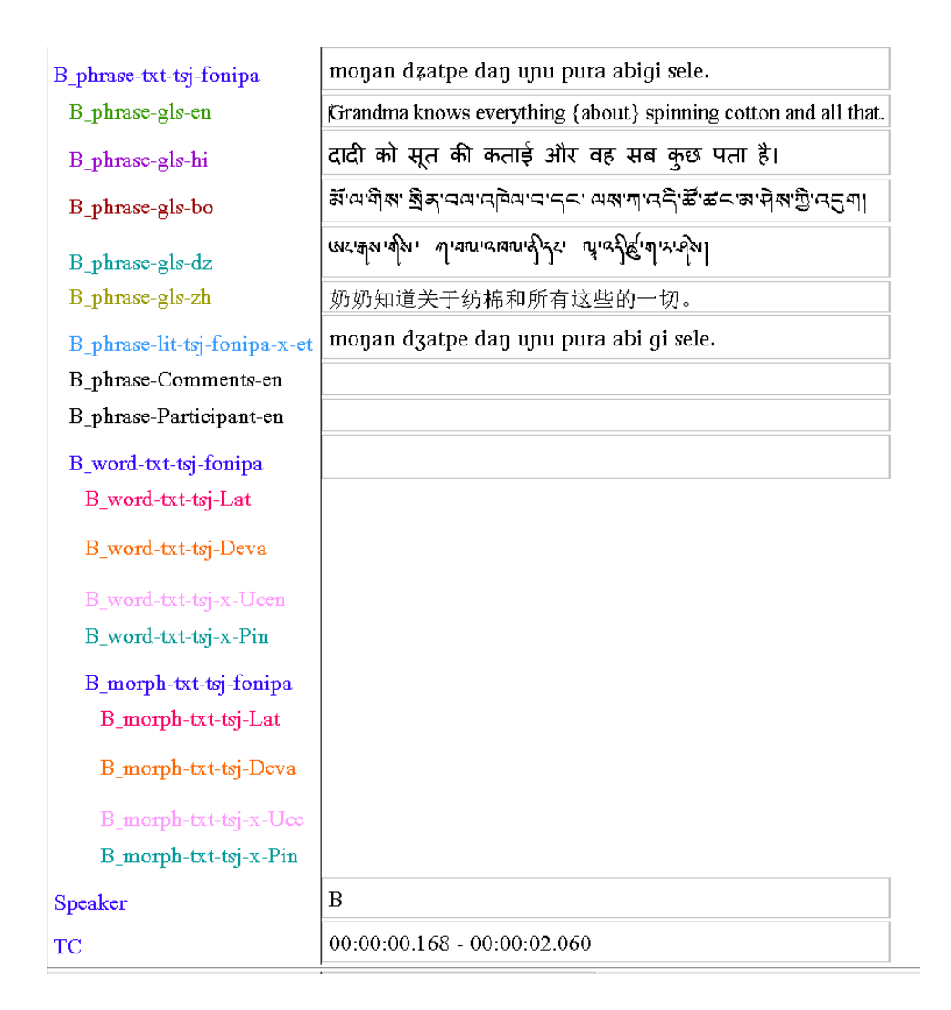
Figure 9. Transcribed and translated text fragment in ELAN's "Interlinearization Mode"

In "Annotation Mode," the same segment, neatly corresponding to the segment in the waveform, looks as in Figure 10.