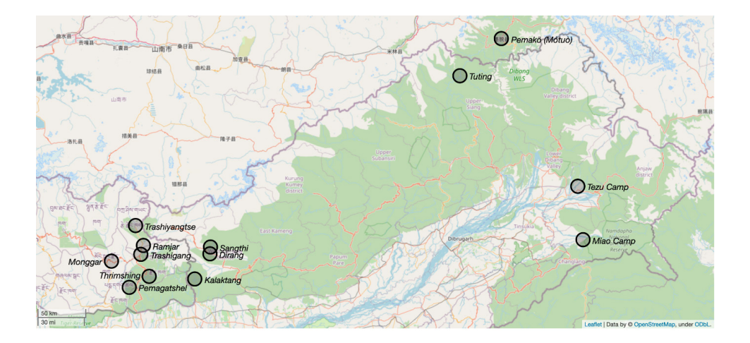
Figure 2. Map of the major present-day Tshangla speech communities and locations of the recordings in this paper (baseline © OpenStreetMap contributors, modified by Mei-Shin Wu)