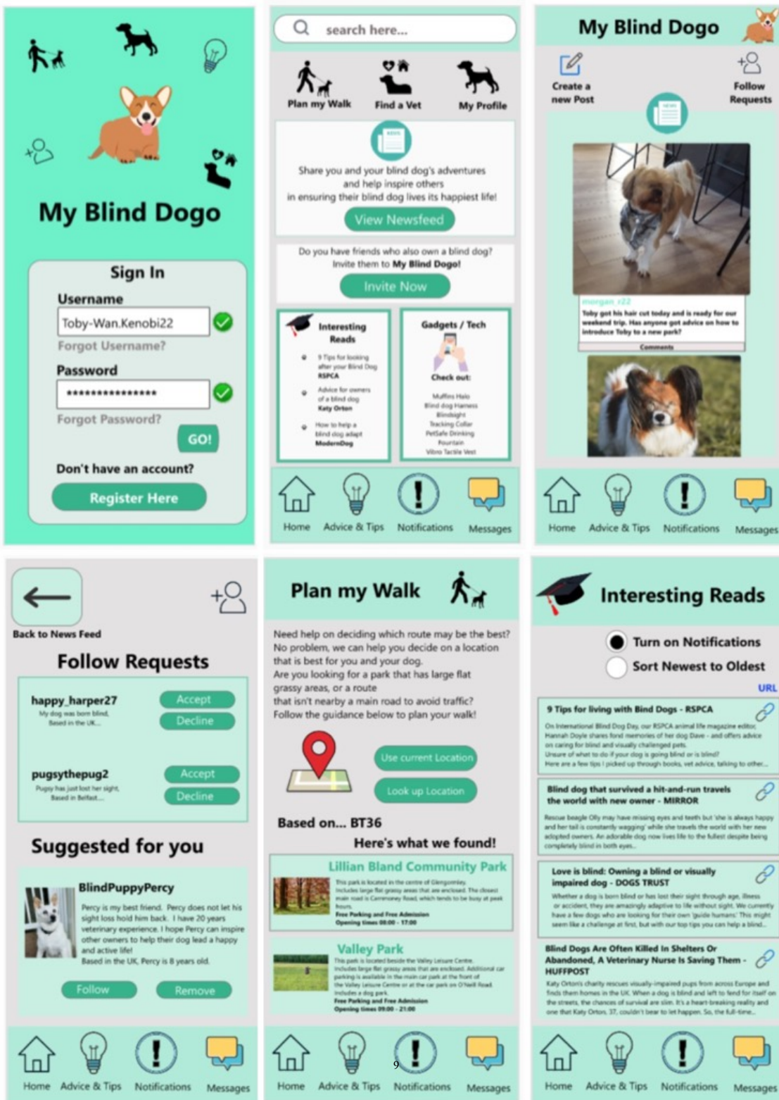
Fig. 2. Example wireframes of a prototype developed to address the interview findings