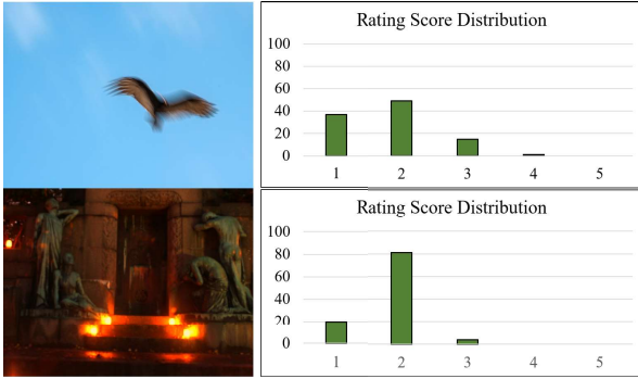
Fig. 2. Examples from the KonIQ-10K database. They have similar MOSs (1.804 vs. 1.848), but are with different rating score distributions.

where B^L and B^U denote the number of labeled data and the number of unlabeled data in a mini-batch, respectively. \tilde{y}_t^\kappa \in \mathbb{R}^{1 \times P} and \tilde{y}_s^\kappa \in \mathbb{R}^{1 \times P} ( \kappa \in \{i, j\} ) respectively indicate the output of teacher and the output of student, where P refers to the maximum scoring scale. By minimizing \mathcal{L}_s^U during the training process, the network would enforce the student to mimic output activations of individual examples represented by the teacher.