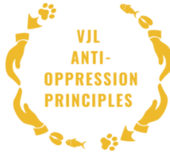
Figure 1. Vegan Justice League's Anti-oppression logo.