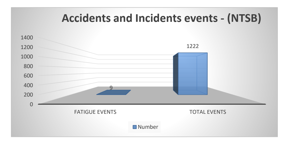
Figure 3 – Accidents and Incidents events

total of 9 events, the total applied only to cargo flights are 3 events from airline flights such as FEDEX and UPS.