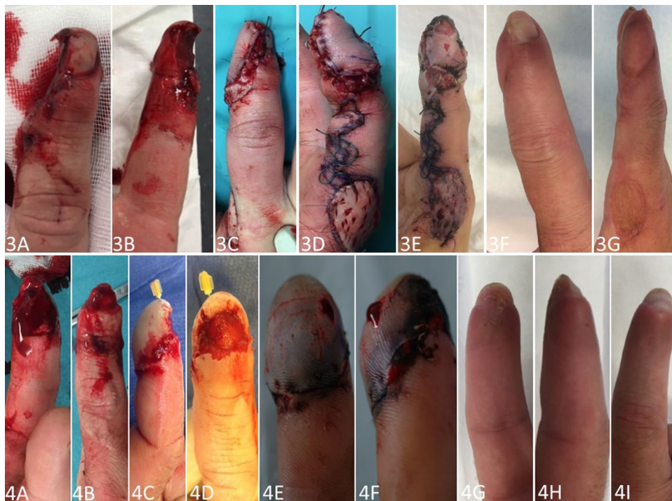
Fig. 2 Case 3 (3A-G): pictures taken after a milling accident of the right index finger of a 50-year-old carpenter. Considering the partial nail matrix laceration (3A) and affected bone (3B), this finger was rated with grade 3 according to Allen Classification. 3C, D: result after replantation of the pulp post operation 4E, F: due to necrosis after 5 days treatment was changed to semi-occlusive dressing therapy after debridement. 4G-I: result after 3 months. Note: atrophic changes of the pulp and nail

pharmaceutical specialist. Considering the amputation level distally to the lunula of the nail (4A, B), this finger was rated with grade 2 according to Allen Classification. 4C, D: result after replantation of the pulp post operation 4E, F: due to necrosis after 5 days treatment was changed to semi-occlusive dressing therapy after debridement. 4G-I: result after 3 months. Note: atrophic changes of the pulp and nail