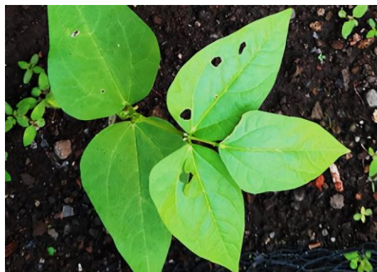
Figure 1. Symptoms of bean leaf beetles