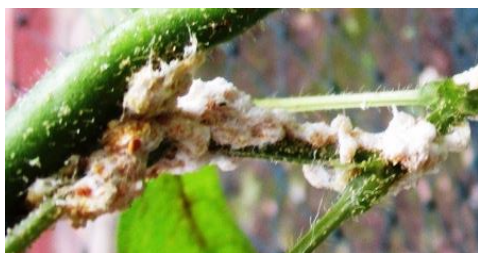
Figure 3. Pink mealybug

are plant innate immunity that plants use to protect themselves from disease pathogens. These secondary metabolites were thought to be in planta antibiotics (Piasecka et al., 2015). All control mung bean Vimal were infected 70 days after planting, whereas 10% EMS of 0.001% treated mung bean Vimal showed no symptoms (Table 10). Uninfected mung bean Vimal pod seeds were stored for future research.