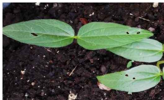
Figure 2. Bean leaf beetle symptoms in mung bean Vimal

researches for achieving a better result. On the other hand, other mutagens and other solvents should be tried for mutagenesis induction in developing new resistant mung bean against bean leaf beetles.