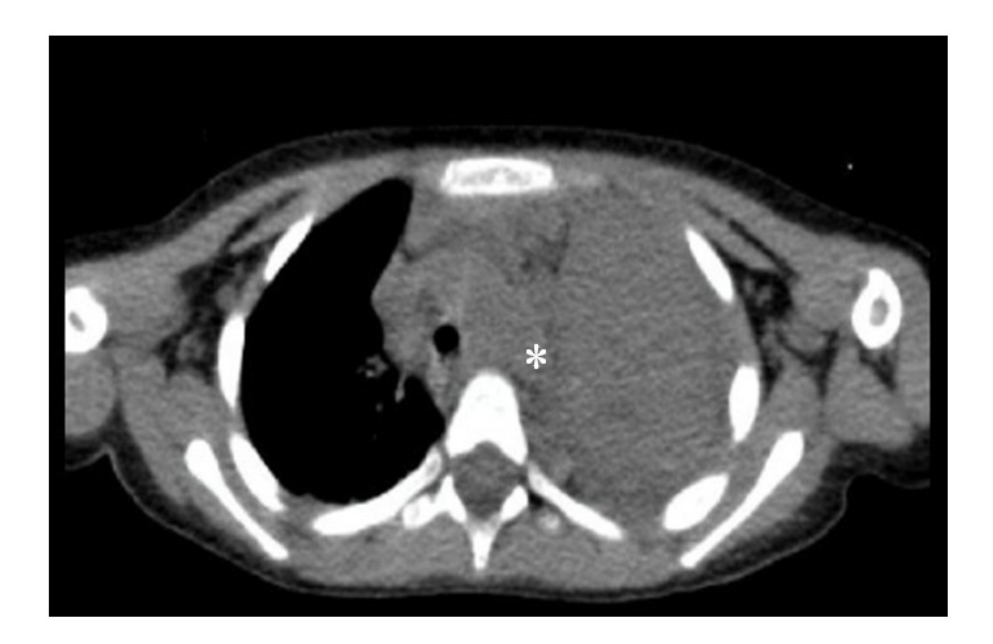
FIGURE 1. Axial section of CT scan of the chest. A solid cystic mass with an amorphous shape, irregular margin, and areas of necrosis was found in the left superior pulmonary lobe (*), sized 5.32 x 6.18 x 6.96 cm<sup>3</sup>.