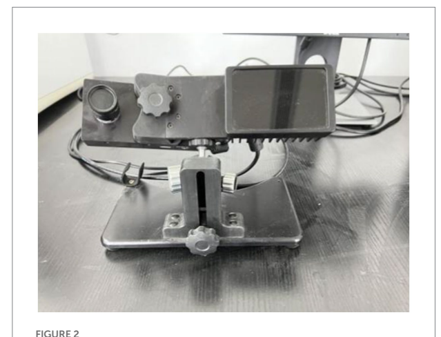
FIGURE 2 EyeLink1000 Desktop Eye Tracker.

The experiment was written and controlled through the Experiment Builder program, and the behavioral data of the subjects were automatically recorded in a text file. The eye tracking instrument is the EyeLink1000 desktop eye tracker (as shown in Figure 2) produced by SR Company in Canada, and the sampling frequency of the eye tracker is 1,000 times/s. Stimulus material was displayed in the center of a 19-inch Dell computer monitor with a resolution of 1,024 \times 768 pixels and a refresh rate of 100 Hz. The distance between the subjects' eyes and the computer screen was about 50 cm. The subjects completed the experimental tasks by pressing the keys on the keyboard. Figure 3 was taken during the operation of the tested experiment.