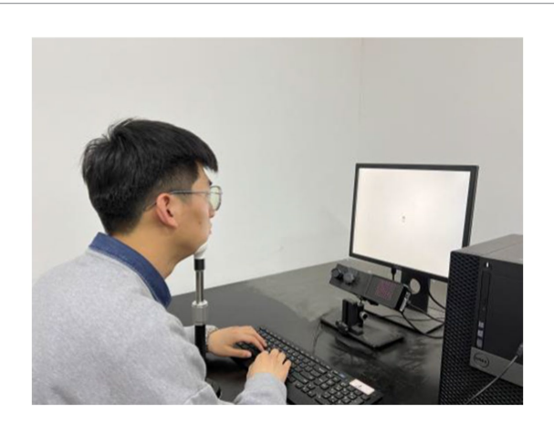
FIGURE 3 Photo of participant participating in the experiment.