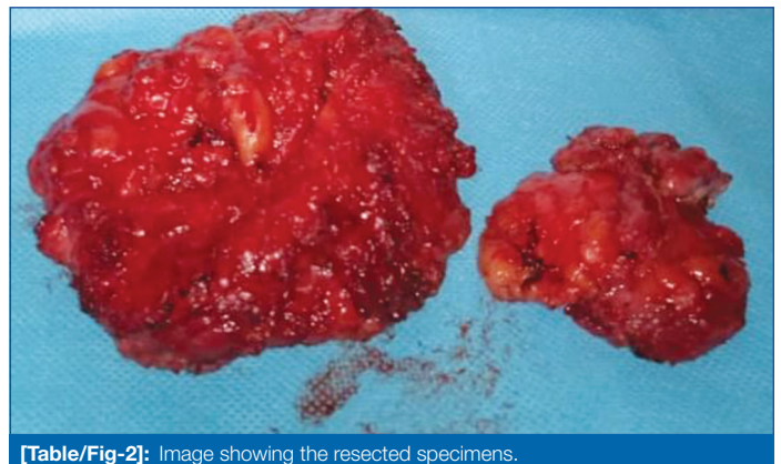
[Table/Fig-2]: Image showing the resected specimens.

Only with clinical assessment, differential diagnoses of pedunculated lipoma and accessory breast tissue were made and was admitted with plan for excision biopsy for confirmation of the diagnosis. Patient underwent surgery in the same admission where complete excision of both the swellings was done under general anaesthesia and the specimen [Table/Fig-2] was sent for histopathological analysis.