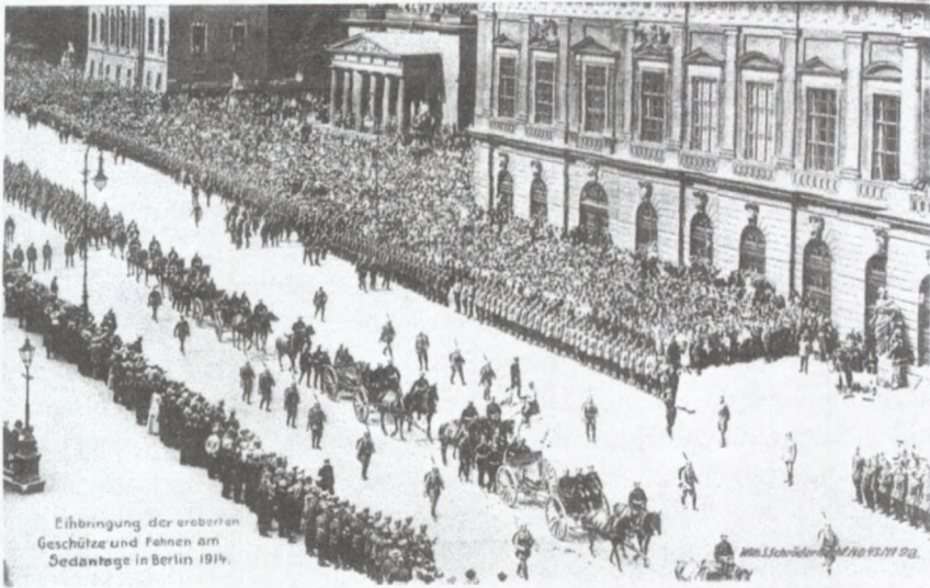
Parade of captured guns and flags on Sedan Day in Berlin, 1914.