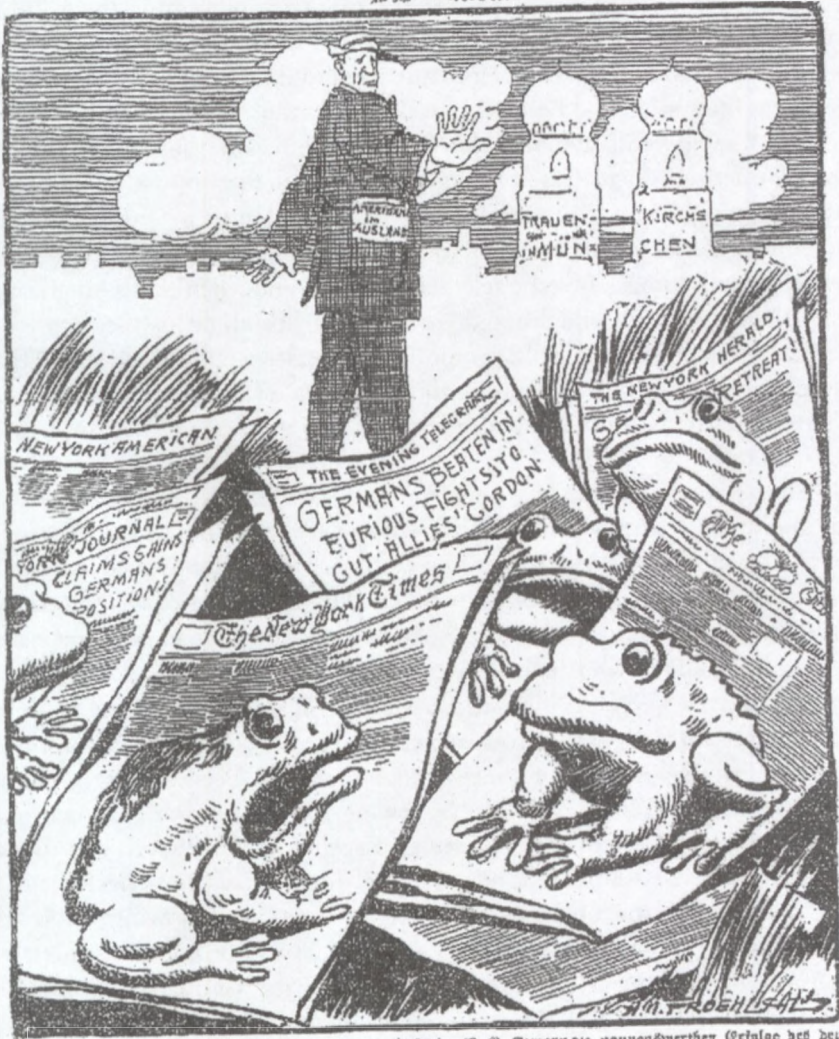
Amerikaner in München: „Wir protestieren dagegen, daß die „N. Y. Times“ die kaumenschweren Erfolge des deutschen Heeres verkleinert.“

The Toads: Americans in Munich: “We are protesting against the fact that the New York Times disparages the astonishing success of the German army.” New-Yorker Staats-Zeitung , October 6, 1914, page 1.