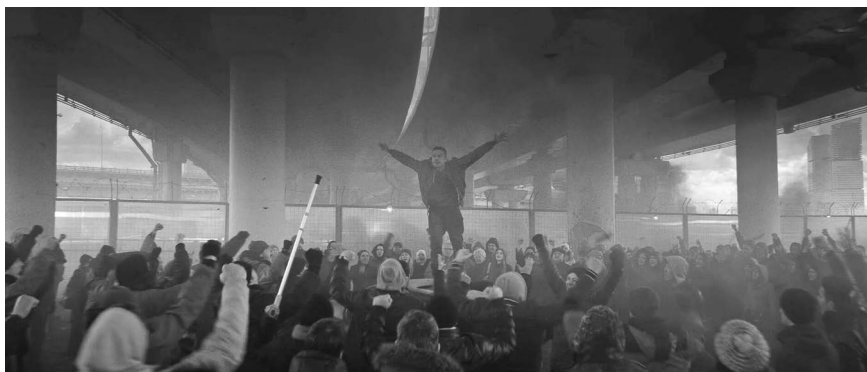
Figures 6.1 & 6.2 Stills from Bondarchuk's Attraction .