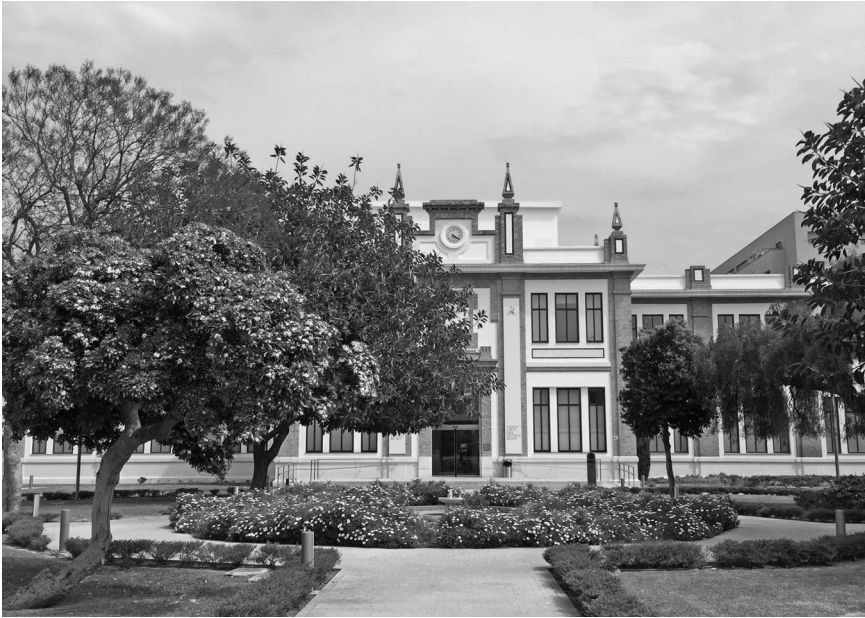
Figure 3.1 Colección del Museo Ruso in Málaga (Julia Bethwaite).

history, and over twenty temporary exhibitions (Colección del Museo Ruso, 2020). While the annual exhibitions have been thematic, the temporary exhibitions have often been dedicated to individual artists, such as Vasili Kandinsky and Kazimir Malevich. These exhibitions have also attempted to highlight the Spanish influence on Russian art, as is suggested by the exhibition ‘Cervantes in Russian Art’. 1 Besides displaying Russian fine art, the exhibitions have contributed to increasing and widening their visitors’ knowledge of Russia by pointing out unexpected and less known factors about its culture and history. For example, some exhibitions have guided visitors through the history of the Romanov family or introduced them to famous cultural characters, such as the poet Anna Akhmatova and the filmmaker Andrei Tarkovsky. Besides exhibitions of visual art, the Colección del Museo Ruso also offers cultural activities in the form of music, cinema and workshops, which are more directed towards the local audience rather than tourists (Aguilar, 2017).