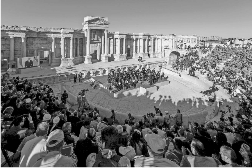
Figure 7.1 Russian conductor Gergiev leads a concert in the ancient Roman theatre in Palmyra.