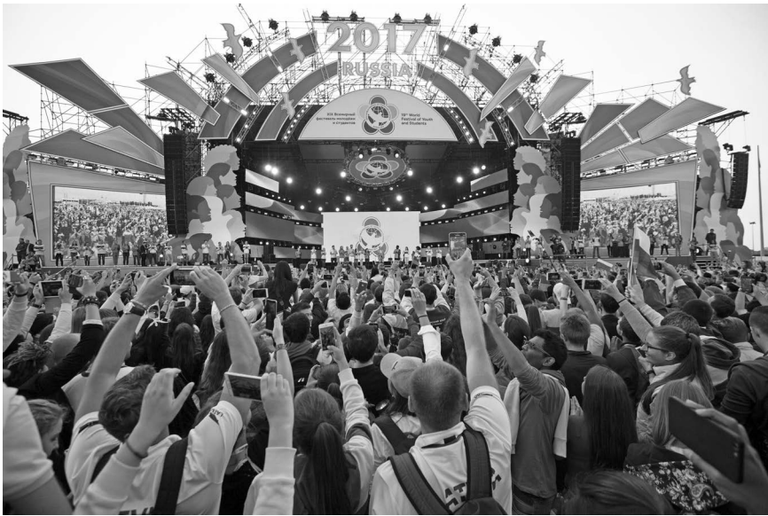
Figure 9.1 The 19th World Festival of Youth and Students in Sochi on 14–22 October 2017 (Reuters, 2017).

The Sochi Youth Festival was the Russian political leadership's endeavor to target foreign and domestic youth as 'the future leaders', promote Russia as a hospitable, modern and generous state, educate volunteers for future international events, as well as find a use for the costly Olympic infrastructure. The festival was a top-down state event for which the government allocated 4.5 billion roubles, and it was organized by a state body, the National Youth Council of Russia (TASS, 2017). According to the World Federation