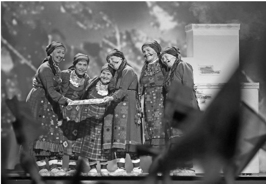
Figure 8.1 The performance by the Buranovskie Babushki in 2012.

Just after hosting the ESC, Russia was subsequently represented in the contest by some less commercial entries – which is not an uncommon strategy used by national broadcasting organisations that have recently staged the contest, so as to avoid winning it too soon again and having to once more bear the expense of hosting it. However, over the course of the 2010s, Russian television increasingly invested in its ESC acts with what appeared to be the intention of again winning the contest. Since 2013, Russian ESC entries have been selected internally by Russia 1 or Channel One alternately, without a public national final or audience vote, which allows the television companies to entirely determine how Russia is represented. During this time, all Russian entries apart from one have placed in the top ten of each ESC edition. Unlike in the 2000s, Russian entries have not engaged with overtly camp aesthetics, but rather embraced more traditional gender iconography, as in the performances by the Buranovskie Babushki (Buranovo Grannies) in 2012 (see, Figure 8.1 ) or the teenage Tolmachevy Sisters, former winners of the Junior Eurovision Song Contest, in 2014 (Kazakov and Hutchings, 2019, p. 139). At the same time, Russian entries have continued to engage with the over-the-top performance tradition of the ESC with striking performances that demonstrate Russian