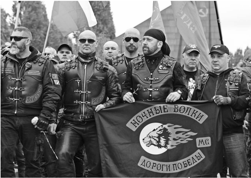
Figure 4.1 Night Wolves take part in celebrations to mark Victory Day in Berlin.

towards the Soviet military burial grounds. Yet, he expressed concern that this tradition might be erased in the future. He asserted that at some commemorative activities that take place in Germany, the role of the Red Army in overcoming Nazism was either diminished or omitted. Instead, attention has been paid to the contribution of the British and American forces, for example, in liberating concentration camps and establishing democracy in post-war Germany. Moreover, he mentioned that the German authorities, in general, focus more on the Jewish genocide than on the annihilation of the Slavic people. He objected to the German authorities' decision to ban the Night Wolves from entering Germany and called on Russia to actively defend its historical memory (TASS, 2015) (see, Figure 4.1 ).