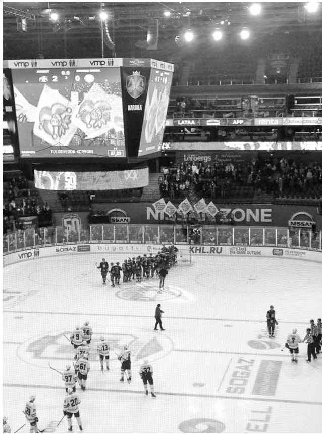
Figure 10.1 Jokerit playing their 50th anniversary game against Dynamo Minsk in October 2017.