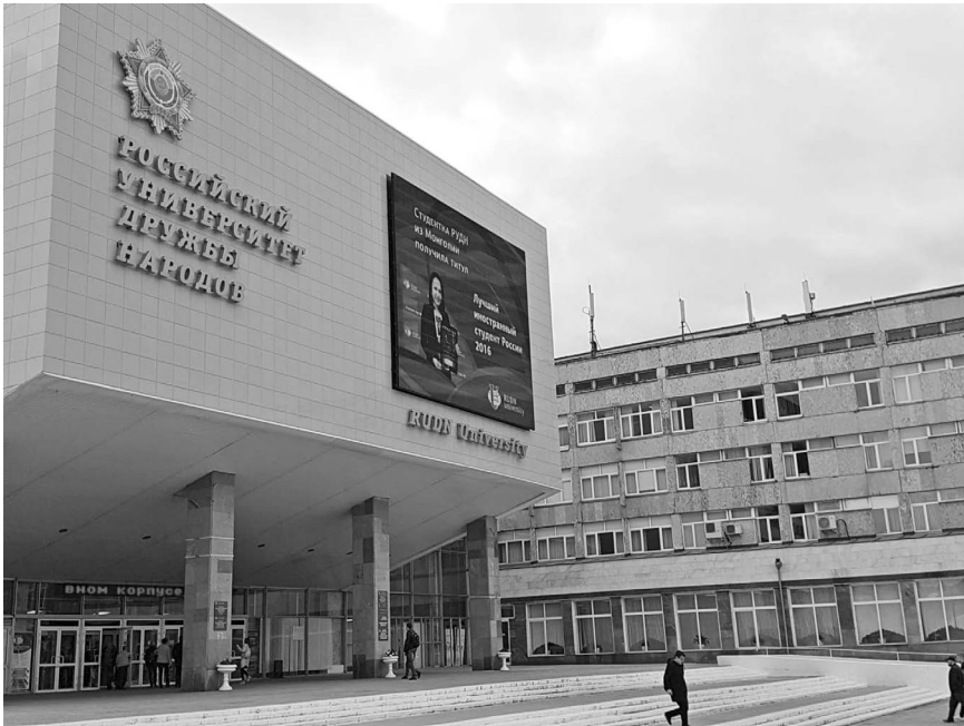
Figure 2.3 People's Friendship University of Russia has been the key recipient of international students in Russia since the 1960s.

of education is directly linked to the image of Russia. For example, one of the interviewees argued that 'if foreign partners learn to know the university [name of the university omitted], and if this experience is positive, then it is reflected as a positive image of the country' (RUS-2, 2016). Another interviewee was convinced of the power of personal experience to change the image of Russia: 'there are a lot of negative things about Russia [...] young people who have been here, they understand that it is not so [...] our former students [...] they have maintained good relations towards Russia. They understand that there is propaganda, and then there are people' (RUS-9, 2018). This is also linked with the idea of graduates as 'ambassadors': 'Our graduates are ambassadors of our university, Russian language and Russian education as a whole' (RUS-8, 2017). There were direct references in the interviews to soft power as well; for example, it was declared that when educating the elites of foreign countries 'we are agents of soft power' (RUS-8, 2017). Similar to the Soviet period, this also had to do with disseminating values: 'any highly developed country, and particularly one of the leaders, to which Russia belongs, should disseminate its values to the world as much as possible' (RUS-10, 2016). As for interactions with alumni, the Peoples' Friendship University of Russia claims to have a well-functioning system of interaction with their Russian and international alumni (PFUR,