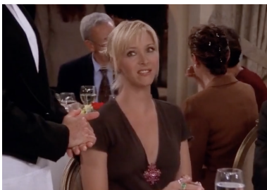
Figure 4: Phoebe having a grumpy facial expression while delivering a laughter provoking line.

In this case Phoebe’s line was delivered with a mean and fed up tone, which was helpful for the model in determining humor. Of course, such a tone is not related to humor in every day speech, so this is an indication of a potential bias in the TV show where such a tone is probably used more often to deliver a punchline of a joke than to actually upset the interlocutor. Even though the multimodal model predicted it correctly, including video modality could strengthen the signal to the model because Phoebe had an uncharacteristically nasty facial expression when uttering her line as seen in Figure 4.