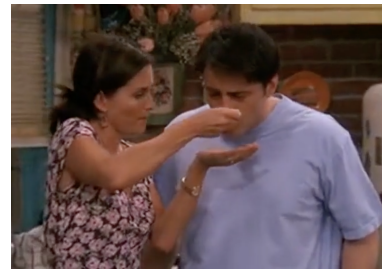
Figure 3: Joey inquiring whether Monica had cooked a person after tasting her food.

In some of these cases where neither of the models predicted the humor right, it is evident that with an access to the video, the model could situate the humor better in the context. The following dialog is an example of such humor: