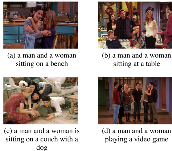
Figure 5: Descriptions produced by the image captioning model

We have also seen that the 10 second contextual window is not always enough to resolve whether something is humorous or not. The issue of increasing the context is that more context will also increase the amount of irrelevant context. We do not believe that simply increasing the context from 10 to 20 seconds, for example, is the most optimal way to go about it because some jokes require more context whereas others do not. Perhaps the best way would be to introduce a third model to the pipeline that is trained to determine how much context is needed by identifying how far back in the dialog we can go and still stay in the same topic. A change in topic would indicate that the context goes too far away from what is needed to interpret the joke.