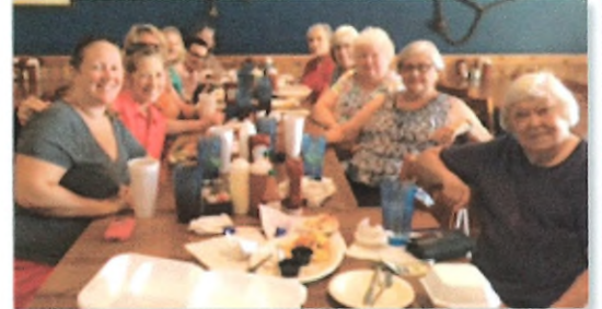
Cherokee Rose Lunch Bunch met for food and fellowship at Crystal River Seafood on July 21.

August 23, 1-5 pm in the Clubhouse. Come join the fun--as the ladies below did in July.