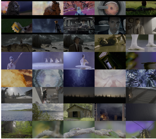
Figure 2: Sample frames from the corpus.