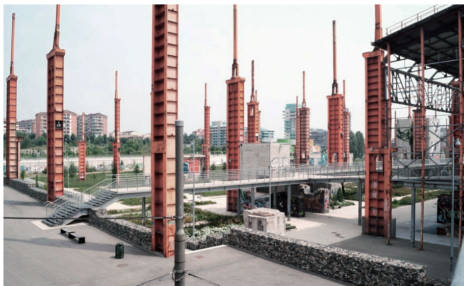
Figure 3. The transformation of the former industrial structures in Parco Dora.

The landscape project by Peter Latz solves environmental and infrastructural issues (on the edge of the park is part of the railway axis of the city) through a careful and elegant redesign of the lawn areas and a strengthening of the forest areas. These, together with the long paths, welcome and reveal in a new and poetic expressiveness the remains of pillars and roofs of iron and steel (Figure 3). The new areas have become places of leisure and culture open to citizens. They are welcoming places open to use for any legitimate need of the inhabitants. The strip canopy, for example, is regularly used by the Muslim community of the city as a place of prayer and celebration of the feasts of worship. The long new walkways partly replicate the existing ones, and together with the rows of hornbeam and ash trees, underline the longitudinal structure of the former Fiat buildings. Ivy and Wisteria Vines envelop new and abandoned facilities, welcoming them once again and contributing to the formal and spatial unity of the project. Dora Park is a part of the Strategic Plan of the Green Infrastructure of the city of Turin and continues to constantly expand its arboreal heritage. It happened thanks to participatory forestry measures implemented by the municipality through the initiative for mitigation of climate “1000 trees for Turin”.