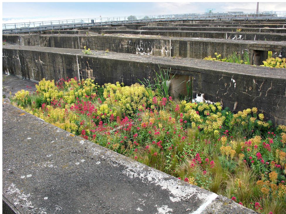
Figure 1. The former naval base of Saint Nazare as a park.

Seguin Island (2009–Ongoing), Paris, Michel Desvigne