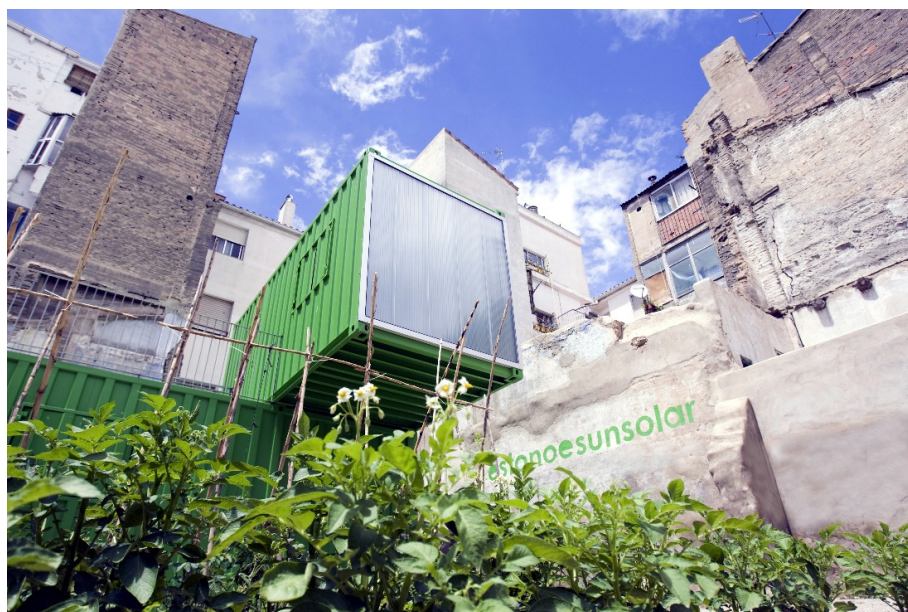
Figure 4. One of the lots renovated through the Esto no es un solar program in Saragoza.