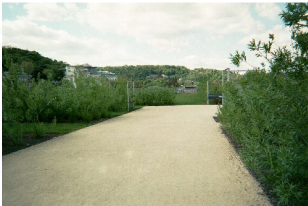
Figure 2. The progress of transformation of Seguin Island. © Fabio Ugucioni.

factory. In order to redevelop the big city space of Boulogne-Billancourt (74 hectares) that remained unused after Renault abandoned it in 1992, the municipality, in 2004, formed the operator SPL (Société Publique Locale) Val de Seine Aménagement . It has to promote, coordinate and manage open space transformation projects in the whole area on both public and private properties. Until 2009, the island had been abandoned, and it had looked like a massive flat concrete plane in the middle of the river Seine. The aim of the author was to activate a process starting with a ‘prefiguration garden’ based on a regular pattern in which rectangles of a mineral surface alternate with rectangles of a permeable surface. More than a project, it is a pattern, a trigger, which will, in time, evolve into a park (Figure 2).