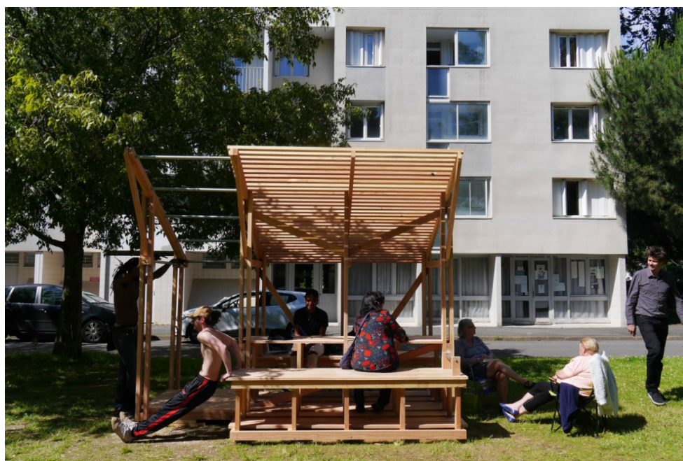
Figure 5. An ephemeral construction in the park of Saragosse.