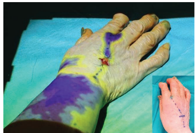
Fig. 1. Intraoperative projection mapping image of the MIPS. ICG fluorescence signals are projected onto the right hand with color gradation.

Related Digital Media are available in the full-text version of the article on www.PRSGlobalOpen.com .