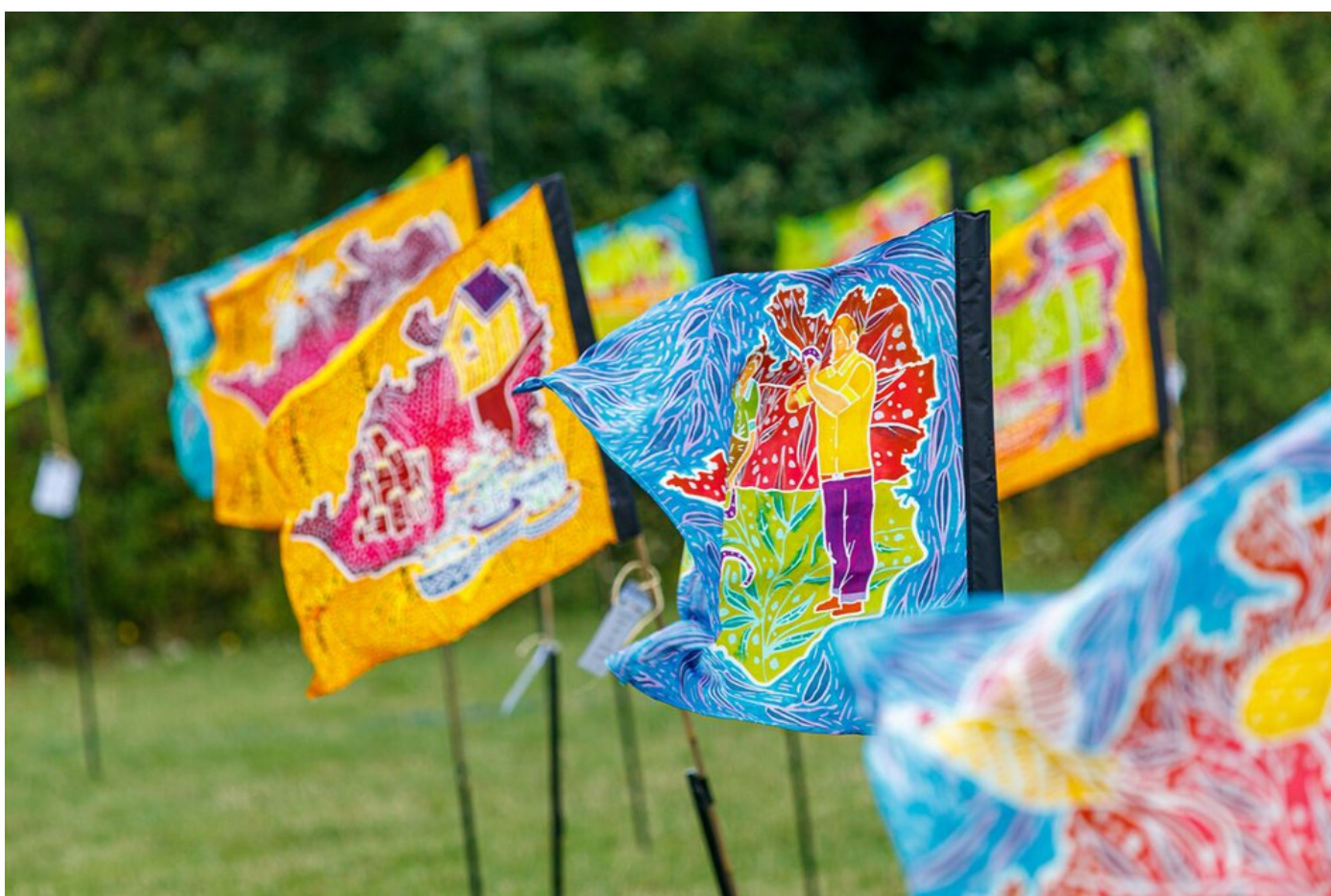
Land of the Fanns Flags

The 100 stories are recorded on the project website, and each has a corresponding flag design; imagery relating to the story framed by the outline shape of the Land of the Fanns region, painted on silk. The flags are brightly coloured; acid yellows, greens and turquoise with hot pink and red outlined in the white distinctive of silk and batik painting. The imagery is varied – waterscapes and flowers, eels and bicycles, cakes and footprints, some are designed and painted by the teller of the story, whilst others have been interpreted or painted from a paper design by Kinetika. As restrictions lifted in late spring 2021 the 100 flags became part of a walking festival ‘Tales of the Fanns’, pitched en masse in a display and carried by walkers through the landscapes that inspired them.