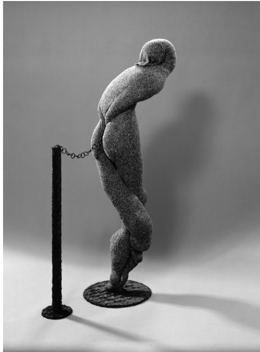
10.2 Dorothea Tanning, De quel amour (By What Love) , 1969. Tweed, metal, wool, chain, and plush.

for her artworks – such as the modernist novels of James Joyce and realism of Gustave Flaubert: ‘What would Molly Bloom think of Emma Bovary? (My cloth sculpture of 1970, “Emma”?).’ 28 Indeed, Tanning’s soft sculpture Emma is the only illustration reproduced to accompany her writing in this instance. However, towards the end of her essay she also mentions a second example from this soft sculptural output: ‘Racine’s Ariane turned into a cloth sculpture de quel amour ’, meaning that the absent classical figure from Jean-Baptiste Racine’s seventeenth-century French play Phèdre (1677) had, for Tanning, become manifest as a soft sculpture with tweedy buttocks chained to a post, By What Love? (1969) (Figure 10.2). Her source text becomes an active participant when translated into a literary sculpture. One might note that her soft sculptural output is roughly equivalent in terms of their limited ‘edition’ to her non-fiction writing – the point being that Tanning was willing to experiment with both soft sculpture and non-fiction writing beyond her better-known practices in painting and poetry. For Tanning, ‘Some Parallels’ is indicative of the fact that she was fluent in both