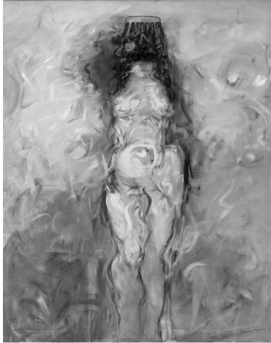
10.1 Dorothea Tanning, Woman Artist, Nude, Standing , 1985–87. Oil on canvas

statements. Such parallels between media become even more apparent in an essay published the same year.