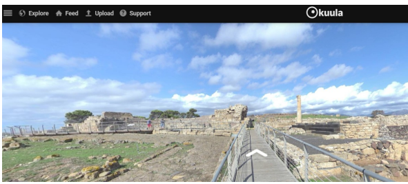
Figure 11. Point of view during the tour route where the white arrow that allows movements appears: clicking on it takes you to Figure 12.