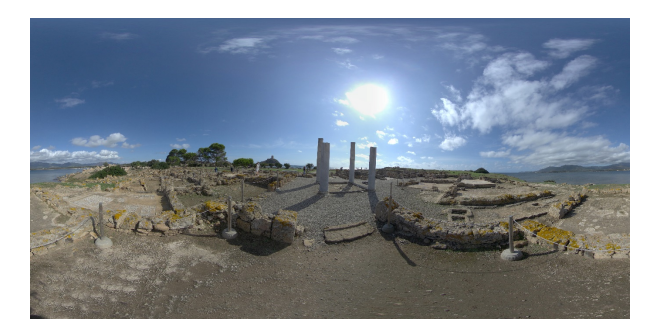
Figure 7. Panoramic view of the archaeological site of Nora.