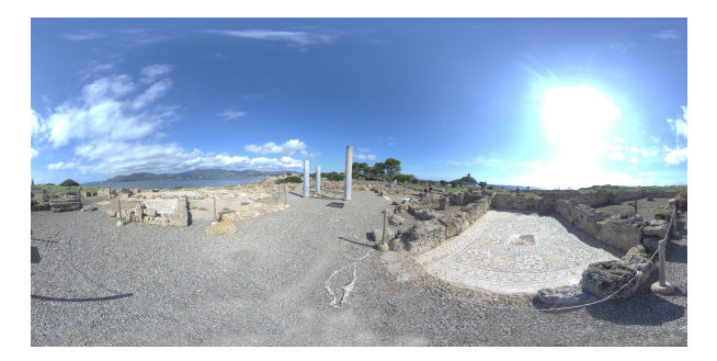
Figure 8. Panoramic view of the archaeological site of Nora.