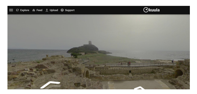
Figure 14. Viewing spot not accessible to tourists.