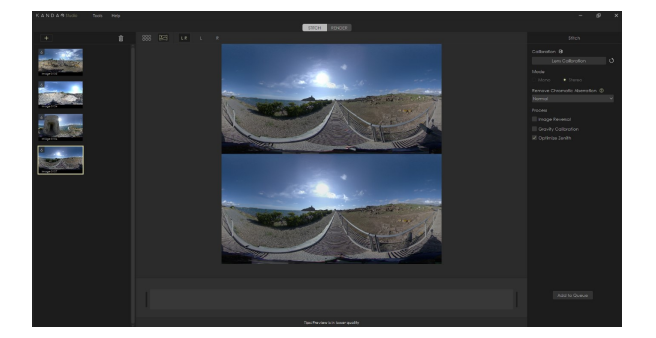
Figure 9. Processing of the panoramic view using the Kandao Studio software.

The software has a very intuitive and user friendly interface. It is possible to check the result of the overlays and manually set certain options in order to avoid problems of incorrect image alignment (Figure 9).