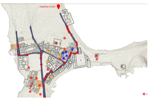
Figure 10. The start of the virtual tour from the plan of the archaeological site of Nora.

The virtual site visit, therefore, can be done either sequentially by following the connections between one image and another or randomly by locating the site of interest directly on the map depending on the user's interest.