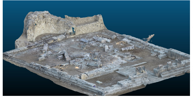
Figure 2. Photogrammetric reconstruction of the exavation area Apollo Temple in Gortyn (Crete).

The International Archives of the Photogrammetry, Remote Sensing and Spatial Information Sciences, Volume XLVIII-2/W1-2022 7th International Workshop LowCost 3D – Sensors, Algorithms, Applications, 15–16 December 2022, Würzburg, Germany