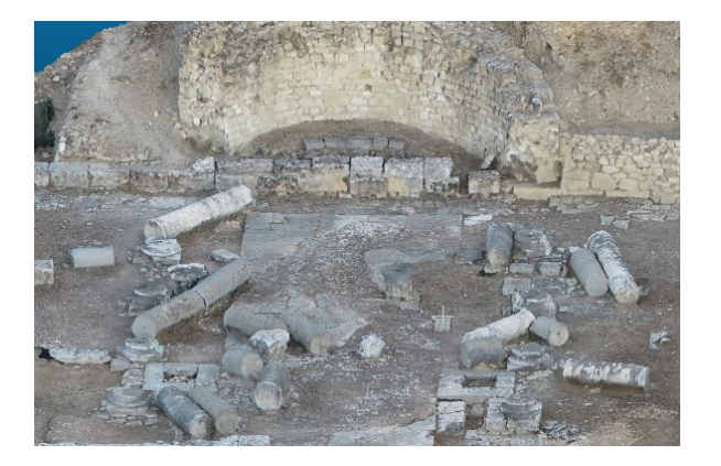
Figure 4. Photogrammetric reconstruction of architectural elements inside the temple.