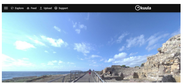
Figure 12. Point of view during the visit route following Figure 11 in which the white arrow appears to allow movements.