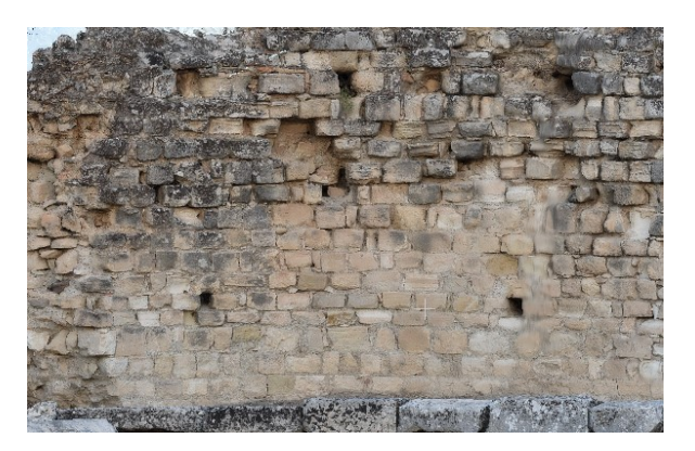
Figure 3. Photogrammetric reconstruction of a detail of the apse of the temple.

Figure 2. Photogrammetric reconstruction of the exavation area Apollo Temple in Gortyn (Crete).