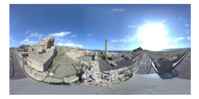
Figure 6. Panoramic view of the archaeological site of Nora.

The International Archives of the Photogrammetry, Remote Sensing and Spatial Information Sciences, Volume XLVIII-2/W1-2022 7th International Workshop LowCost 3D – Sensors, Algorithms, Applications, 15–16 December 2022, Würzburg, Germany