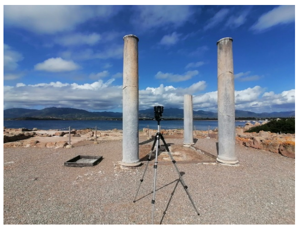
Figure 5. Kandao Obsidian R 8K camera positioned along the tourist route of the excavation.

For this reason, the instrument used for the acquisition of the images was the Kandao Obsidian R 8K 360° VR camera, which is capable of capturing very high resolution 360° 3D images and videos thanks to six fisheye lenses (Figure 5).