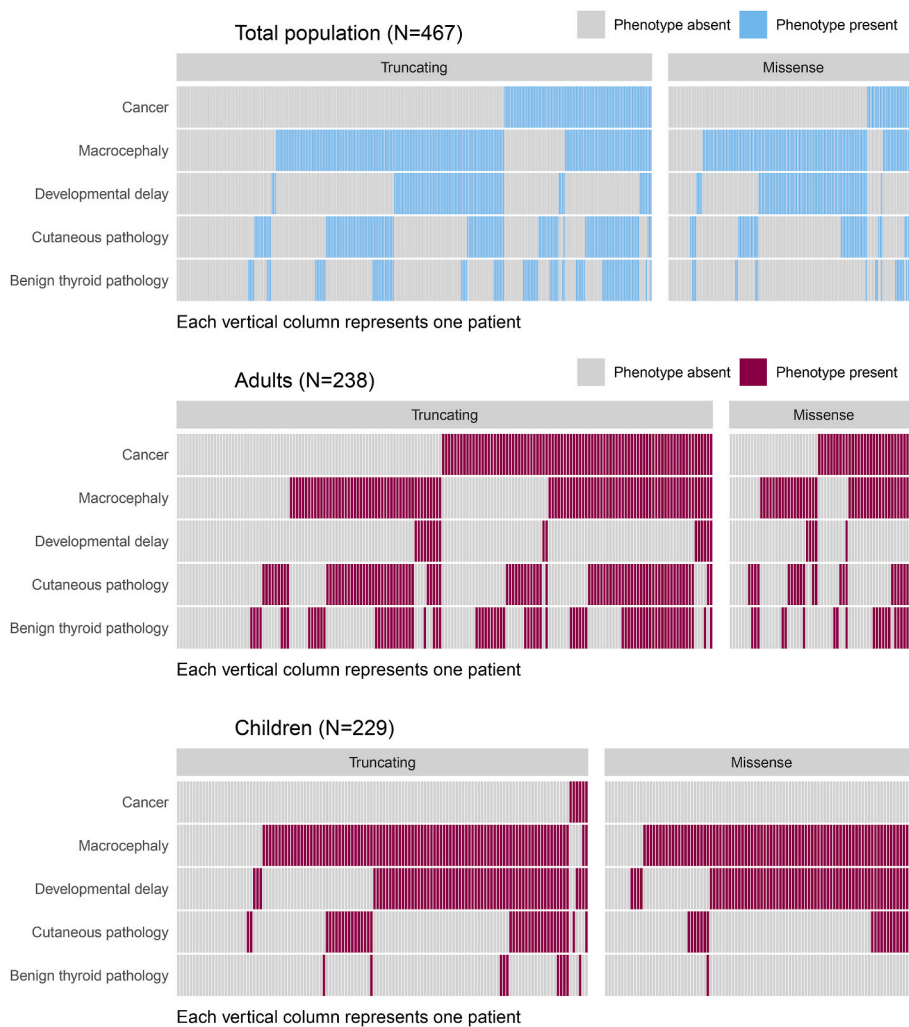
Fig. 1. Phenotypic presentation of each individual index patient, with patients grouped by variant type and age. Schematic phenotypic presentation of all index patients with a pathogenic or likely pathogenic PTEN germline variant. Each vertical bar represents one patient. Patients are grouped by variant coding effect (truncating = left; missense = right). The results for the total population (N = 467) are presented on the top, where grey represents that the phenotypic category is absent, and blue that the category is present. The results are presented separately for adults (N = 238) and children (N = 229) below, where grey represents that the phenotypic category is absent, and pink that the category is present.

predicted. However, no phenotypic differences were observed for NMD and non-NMD truncating variants introducing a premature stop codon (data not shown).