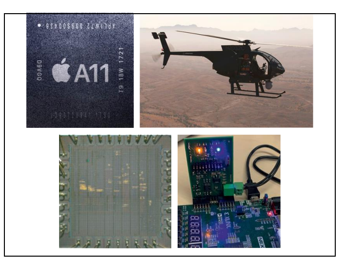
Fig. 4. Examples of new approaches applied in research, prototypes, and products. Clockwise: 1) Apple A11 chip with Secure Element, using the L4 operating system kernel; 2) Unmanned Boeing helicopter using the open and proved-correct seL4; 3) Security module using the open LEON SPARC v8 processor; 4) Prototype of an open security module using the open VexRiscv processor, with a hardware accelerator for ChaCha stream encryption, created exclusively with open design tools (running on an FPGA chip).

The only approach that can completely rule out faults is mathematical proof. For operating systems this was pioneered by seL4 , a member of the L4 family of operating system microkernels (Klein et al. 2014, cf. Fig. 4).