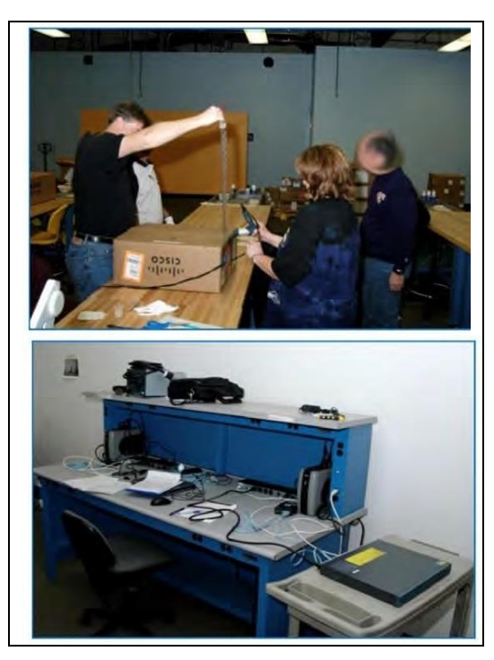
Fig. 3. NSA employees opening a Cisco parcel (above) and a load-station for implanting a beacon (below).