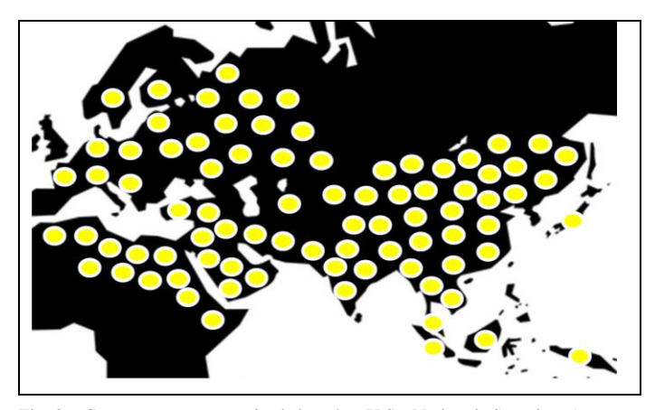
Fig. 2. Computers compromised by the U.S. National Security Agency (NSA), by 2013. Each dot represents >500 devices. Whistleblower Edward Snowden published that machines from HP, Dell, and Cisco were compromised, and the companies Belgacom and Gemalto were hacked (Appelbaum 2013).

There is a current debate in the European Union on whether IT security can be improved by regulating hardware and software, for example, by requiring certification in accordance with the Common Criteria or the 2019 EU Cybersecurity Act . In practice, such certifications provide very limited protection, as they focus on development processes and testing and are thus unable to establish security.