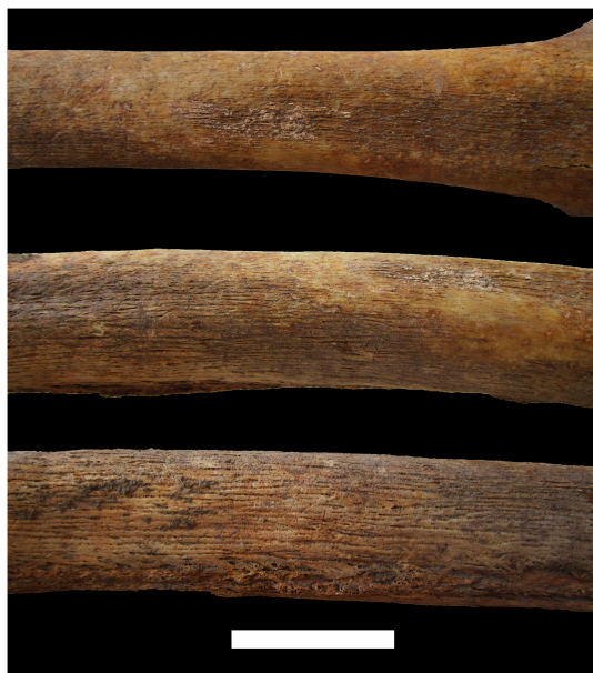
FIGURE 5 Periostitis; top: left anterior distal 1/3 femoral shaft; middle: right lateral femoral midshaft; bottom: right middle femoral midshaft of MA? male, Grave 47, scale = 5 cm [Colour figure can be viewed at wileyonlinelibrary.com ]