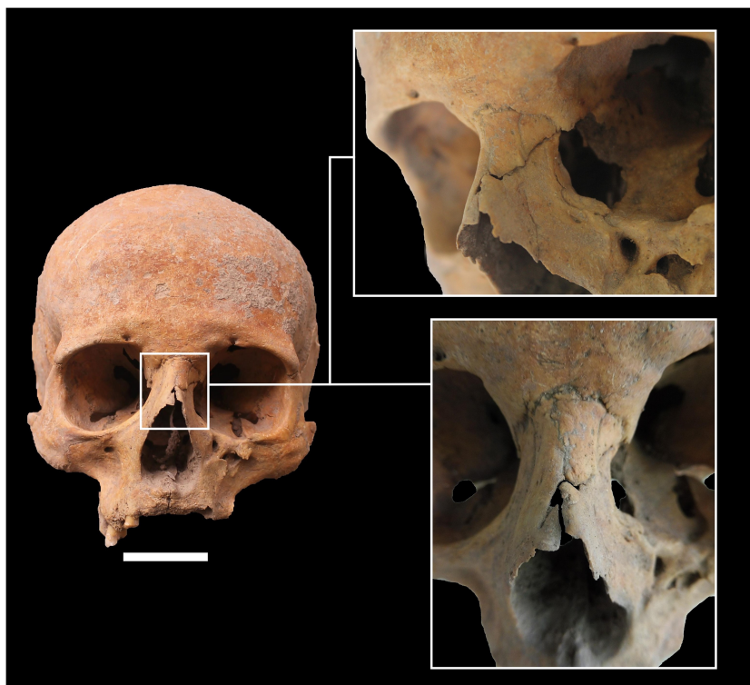
FIGURE 4 Fracture on the nasal bone of MA male, Grave 65, scale = 5 cm [Colour figure can be viewed at wileyonlinelibrary.com ]