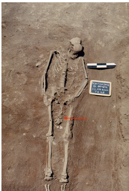
FIGURE 6 Tomb 48, Pontokomi-Vrysi assemblage. Inhumation of female individual with fetus just below the pelvic area shown with red arrow [Colour figure can be viewed at wileyonlinelibrary.com ]

dying (hidden heterogeneity risks) (Wood et al., 1992). Among several other paleodemographic biases, the unequal nonadult to adult ratio is frequently encountered in osteoarcheology. In the Pontokomi-Vrysi sample, however, these groups are almost equally represented. This may be attributed to the carefully excavated site, the excellent bone preservation, and the uniform mortuary treatment of all age groups. It should be stressed, however, that the excavation was a rescue one and, therefore, underrepresentation biases might act upon the sample, since it is not certain if the entire burial ground has been excavated or if other contemporaneous cemeteries related to the same community existed and have not been found yet (Karamitrou-Mentessidi, 2001). Among nonadults, a high representation of infants and children is