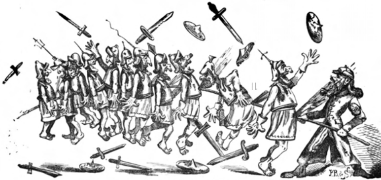
31.—A BIBLE HERO. And after him was Shamgar the son of Anath, which slew of the Philistines six hundred men with an ox goad: and he also delivered Israel.—JUDGES iii., 31.