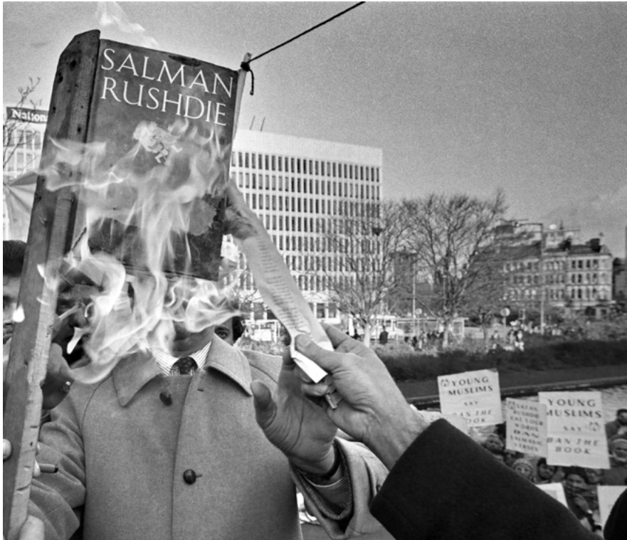
Fig. 19: Muslim protesters organised a book burning at an anti-Rushdie demonstration in Bradford in January 1989, attracting international attention to their cause and provoking a public outcry in liberal media.

ican Cultural Center in Islamabad, in which the first deaths among the demonstrators occurred. 8