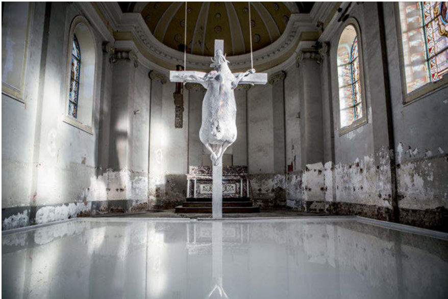
Fig. 1: Tom Herck's installation 'Holy Cow' in the former parish church of Kuttekoven in the Belgian province of Limburg, 2017. Despite its abysmal state, the building's function as a previous place of worship is evident. Photo by Erik Jamar. Kindly reproduced with permission of the artist.

An altar and stained-glass windows were the only religious symbols left in Kuttekoven's church. With the plaster on the walls displaying the results of a merciless humidity and without a pulpit, confessional chair or prayer bank in sight, the building bore all the hallmarks of desertion. In November 2017, however, this parish church in the eastern Belgian province of Limburg suddenly became a focal point for Catholic attention. The reason for this sudden interest was an installation that artist Tom Herck had placed in the nave. 1 It consisted of a mas-