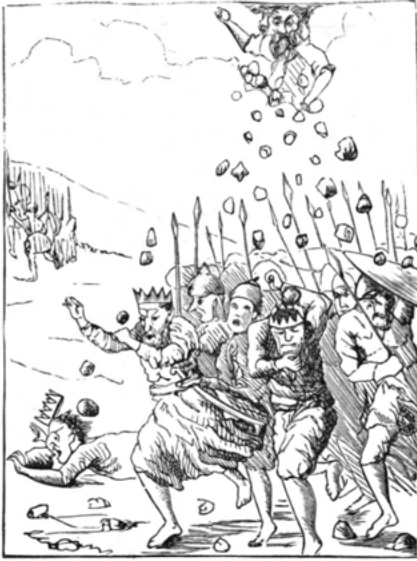
28.—JEHOVAH THROWING STONES. The Lord cast down great stones from heaven upon them unto Azekah and they died.—JOSH. x., 11