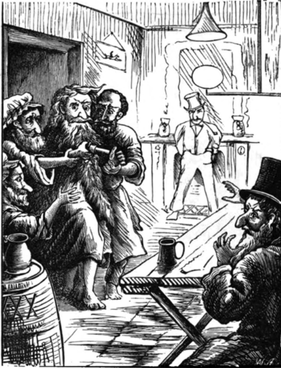
24.—ATTEMPTED ASSASSINATION OF MOSES BY JEHOVAH. And it came to pass by the way in the inn, that the Lord met him, and sought to kill him.—EXODUS IV., 24.

church in the distance beyond the cornfield. The event is also enabled through the thoroughly modern touches of a visible tin of kerosine and a packet of Bryant and May matches.