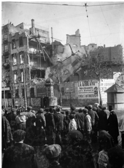
Fig. 17: A crowd observes destruction during the Tragic Week.