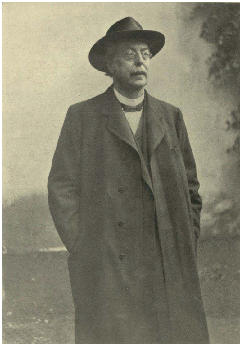
Fig. 6: 'Portrait of Carl Jatho,' published in Carl Jatho: Briefe (Jena: Eugen Diederichs, 1914).

tremely popular among a bourgeoisie alienated from Lutheran orthodoxy. Eugen Diederichs, a famous publisher of avantgarde literature, printed multiple volumes of these sermons and thus helped Jatho become a well-known and popular figure in social reform circles. The latter also wrote numerous books on religious