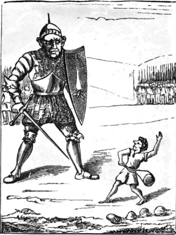
35.—THE CHAMPION GIANT-SLAYER.

So David prevailed over the Philistine with a sling and with a stone and smote the Philistine, and slew him.—1 SAM. xvii., 50, 51