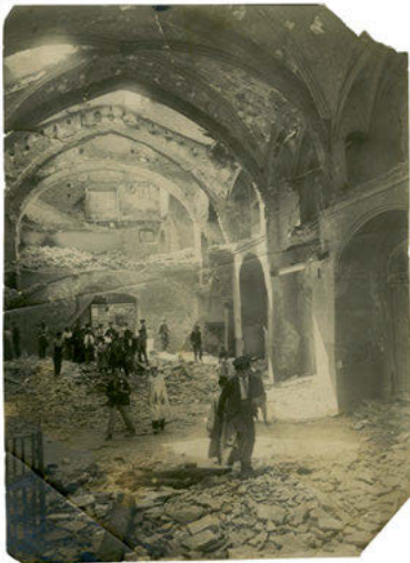
Fig. 18: The church at the Hieronymite convent in Barcelona after the Tragic Week.

mastermind behind the mob was Francisco Ferrer, a libertarian educator and bohemian, who was framed in the aftermath of the Tragic Week. Ferrer had neither planned nor participated in the events, yet he was executed for the crime of “rebellion”. The vilification of Ferrer leaned heavily on ideas of contagion and suggestion underpinning crowd psychology, according to which Ferrer had incited the unthinking crowds to revolt.