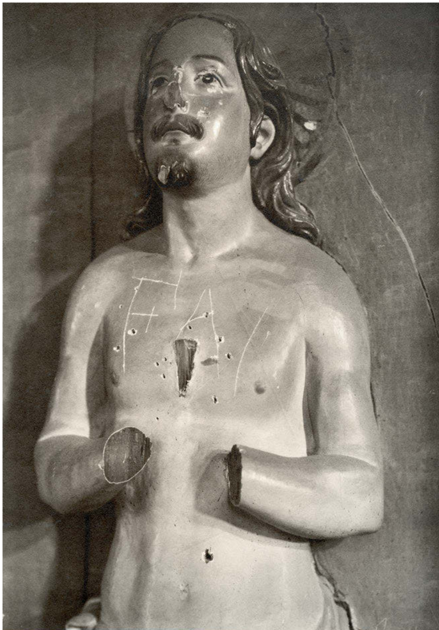
Fig. 4: Destroyed statue of St. John the Evangelist from the Convent of the Franciscan Conception in Toledo, 1936.