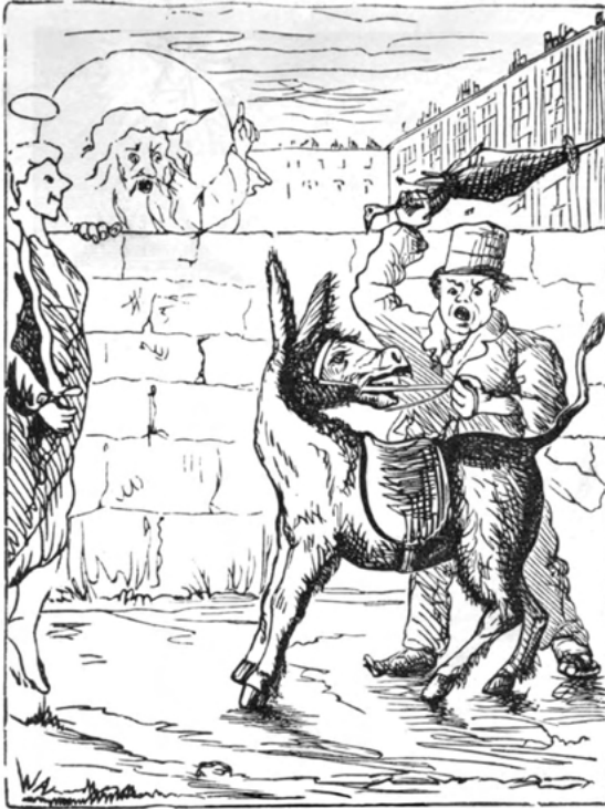
27 — BALAAM'S ASS.

now being cared for by the recently founded Royal Society for the Prevention of Cruelty to Animals. 19