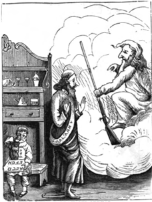
18.—ABRAHAM'S ORDEAL. And it came to pass after these things, that God did tempt Abraham. . . . And he said, Take now thy son, thine only son Isaac, whom thou lovest, and get thee into the land of Moriah; and offer him there for a burnt offering.—Gen. xxii, 1, 2.