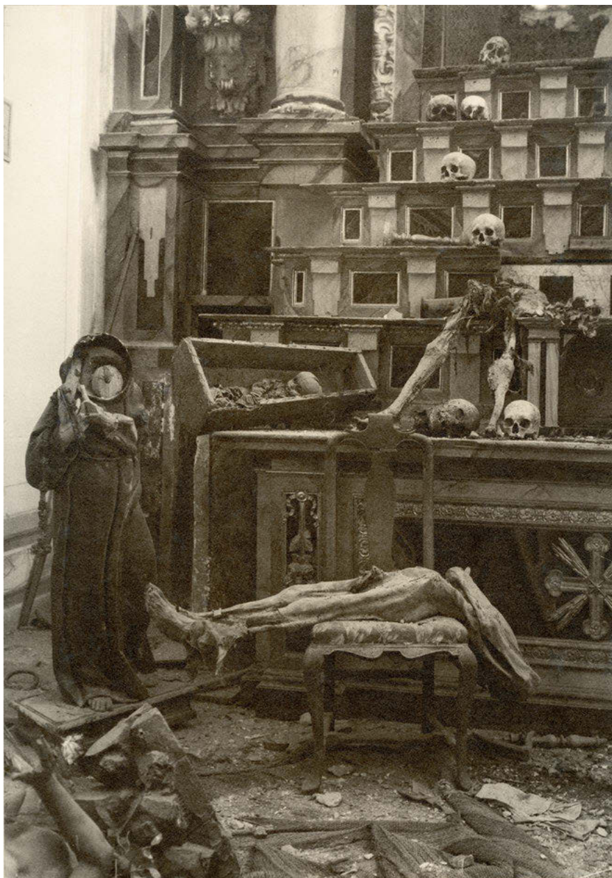
Fig. 5: Desecrated graves at St Michael's Church in Toledo, 1936.