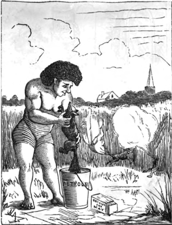
32.—SAMSON AND THE FOXES.

And Samson went and caught three hundred foxes, and took firebrands, and turned tail to tail, and put a firebrand in the midst between two tails. And when he had set the brands on fire, he let them go into the standing corn of the Philistines.—JUDGES xv., 4, 5.