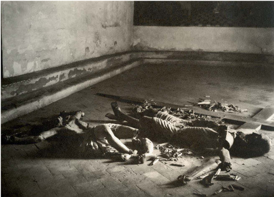
Fig. 3: Destroyed calvary with statues of Christ and the Good Thief at St. Elizabeth’s Convent in Toledo, 1936.