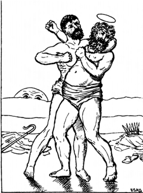
22.—THE LORD'S WRESTLING MATCH.

And when he saw that he prevailed not against him, he touched the hollow of his thigh; and the hollow of Jacob's thigh was out of joint as he wrestled with him.—GENESIS xxxii, 25.