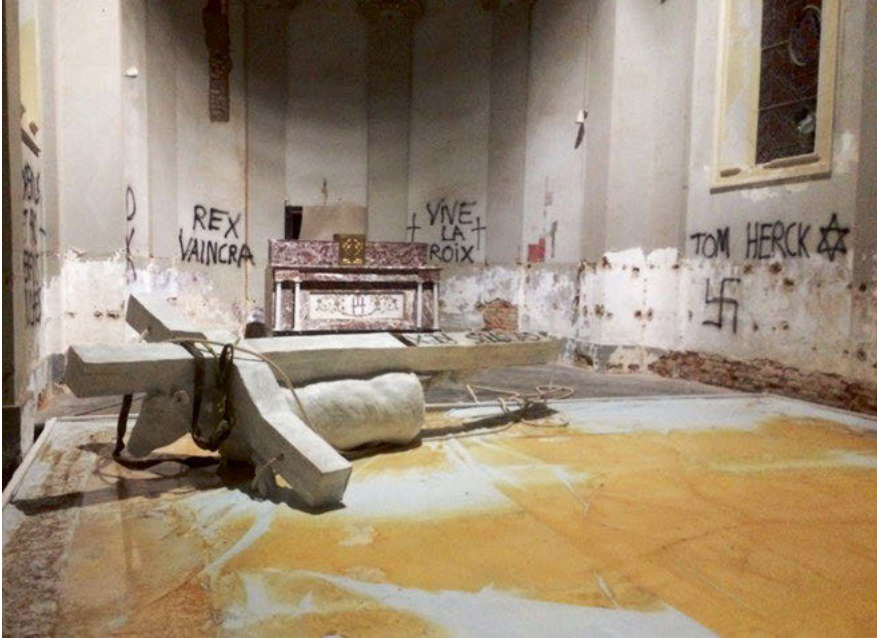
Fig. 2: Destroyed installation ‘Holy Cow’ in Kuttekoven church, 2017. The graffiti on the wall includes religious references and antisemitic symbols; the words “Rex Vaincra” refer to a far-right Catholic and nationalist party active in Belgium during the years 1935–1945.