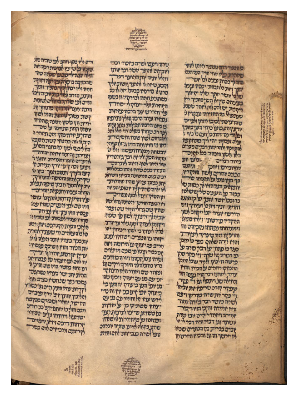
Illustration I: Ms Vienna, hebr. 220, fol. 8v.