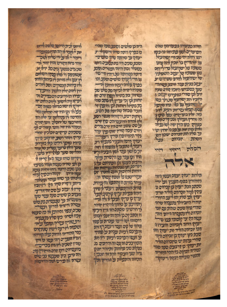
Illustration III: Ms Vienna, hebr. 220, fol. 11r.