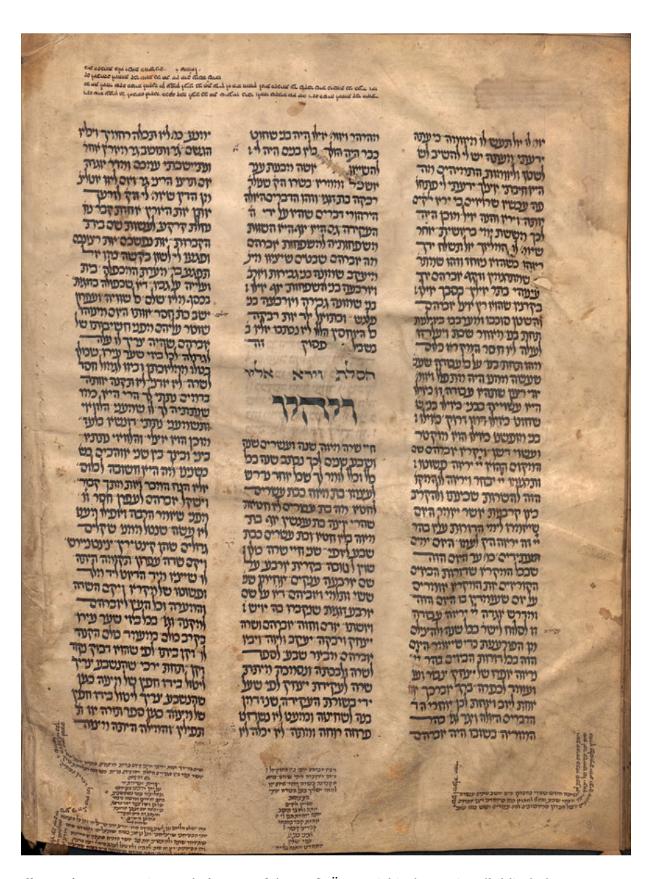
Illustration II: Ms Vienna, hebr. 220, fol. 9v.