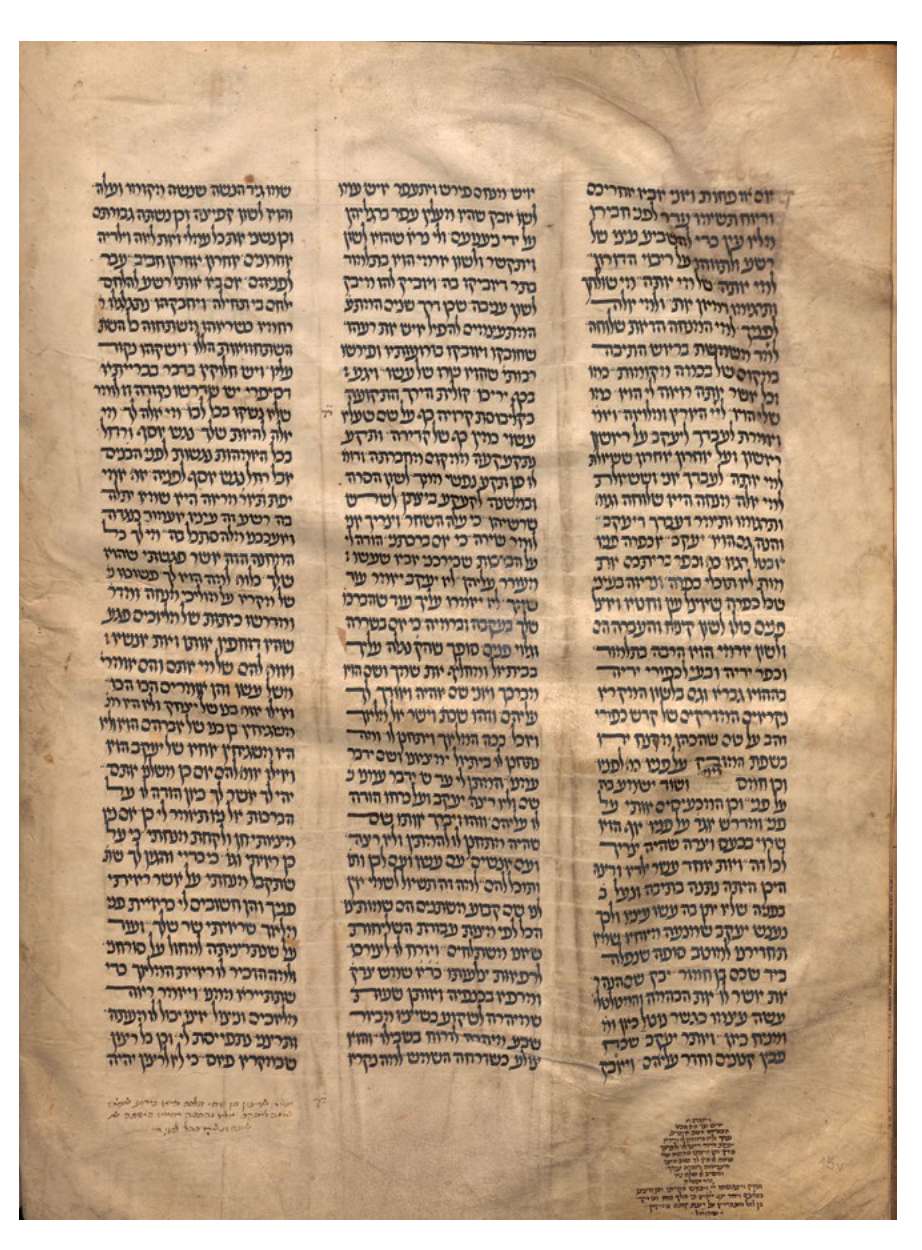
Illustration IV: Ms Vienna, hebr. 220, fol. 15v.