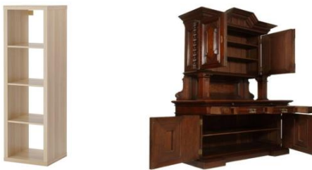
Figure 2. Presentation of the two drawing copy tasks. The basic task 1 (the shelf) and the complex task 2 (the buffet) are copied using Time2sketch software in a virtual environment.

The experiment was structured in 3 steps: (1) participants were asked to complete a series of questionnaires (socio-demographic, drawing experience, VR skills and mental rotation test); (2) then the participants were immersed in a neutral virtual environment (hangar) and were trained to use a VR sketching software named Time2sketch. There was no time limit for them to learn the software. Once they were familiar with the software, they had to perform the sketching tasks in virtual environment. The photos of the pieces of furniture (Fig. 2) to be reproduced in 3D appeared in the immersive environment. The two VR sketching tasks were presented randomly and consecutively to the participants. Participant had 10 min to make the basic task (the shelf – task 1) and 20 minutes for the complex task (the buffet – task 2). The instructions imposed were always the same: “reproduce the furniture as faithfully as possible, taking into account the volumes”. These two pieces of furniture have been selected according to their complexity. The shelf (task 1) is a simple task with a simple geometric shape, while the buffet is a complex task requiring to take into account the opening angle of the cabinets and drawers and many details. (3) Finally, the participants were asked to answer the SUS questionnaire.