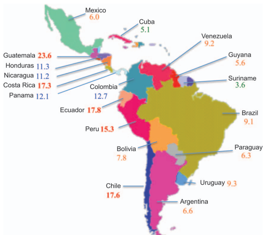
Figure 1. Stomach cancer age adjusted death rates per 100,000habitants/y in Latin America.

Given the success of preventive care strategies implemented in other countries such as Japan, [12] the Ministry of Health for Chile