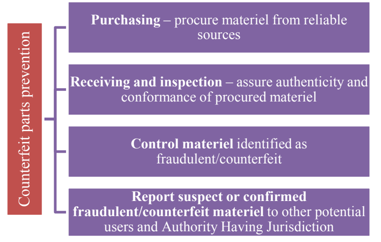
Figure 1. Steps to prevent the use of counterfeit parts [3]

The main steps to prevent the use of counterfeit parts within an organization are illustrated in the figure below.